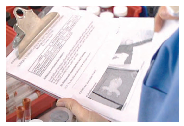
Fig. 1.2: Forensic pathologist reviewing a pre-autopsy report.

Too often, critical scene information fails to reach the forensic pathologist before the autopsy is performed. In an effort to remedy this communication gap and to provide the forensic pathologist with critical scene data before the autopsy, there is now a standardized pre-autopsy report (PAR) that can be generated electronically through the SUIDI Reporting System (mdilog.net). Included in the electronic reporting system is a post-autopsy conclusions (PAC) feedback loop that allows the forensic pathologist to report autopsy findings back to the scene investigator for case updating, review, and printing of the death certificate.