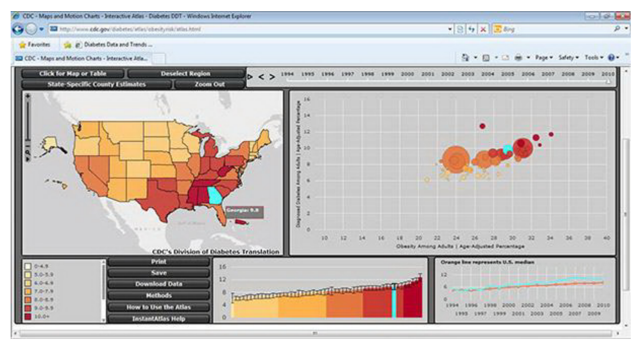
Figure 2. Screenshot of the default display of the maps and motion charts on diabetes and its risk factors for all states in the Diabetes Interactive Atlas (www.cdc.gov/diabetes/atlas/obesityrisk/atlas.html). [A text description of this figure is also available.]

The Web page "Maps and Motion Charts — All States" (www.cdc.gov/diabetes/atlas/obesityrisk/atlas.html) presents more information and the default display is more complicated than other displays of the atlas. The default display (Figure 2) shows 4 images depicting data on all 50 states: 1) a choropleth map of age-adjusted diabetes prevalence (which can be switched to a table view), 2) a bubble chart of age-adjusted diabetes and obesity prevalence, 3) a bar chart of age-adjusted diabetes prevalence, and 4) a chart of the US median age-adjusted prevalence of diabetes from 1994 to 2010. In addition, the page shows a time animation bar. The default display of the state data is the national view; however, the user can click on the "Select Region" button and view state data by US census region or division. The bar chart shows the indicator value with lower and upper confidence limits for each state for each year. The degree of uncertainty for each estimate is discerned by examining the error bars, which indicate lower and upper limits. For example, a precise estimate will have a narrow interval. The time-series chart displays an orange trend line that represents the US median prevalence for each year. When the user moves the mouse over a state in the map, bubble chart, or bar chart, the trend line for that state is shown and can be compared with the US median.