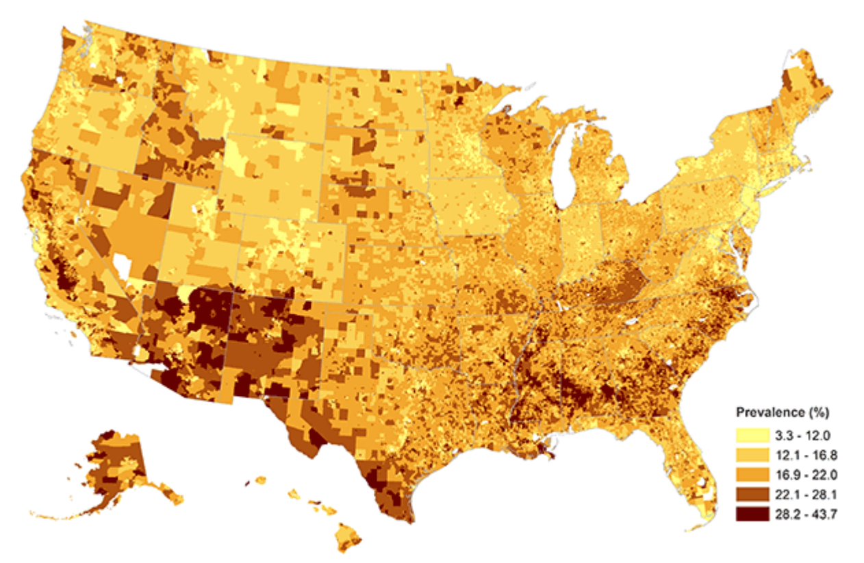
Figure 2. Model-Based Childhood Obesity Prevalence Estimates by Block Group in the United States, 2010. [A text description of this figure is also available.]

metropolitan areas such as New York, Los Angeles, and Chicago; 2) Southeastern and Midwestern rural areas; 3) along the US-Mexican border in Texas and California; and 4) in some local tribal areas in western and northern states.