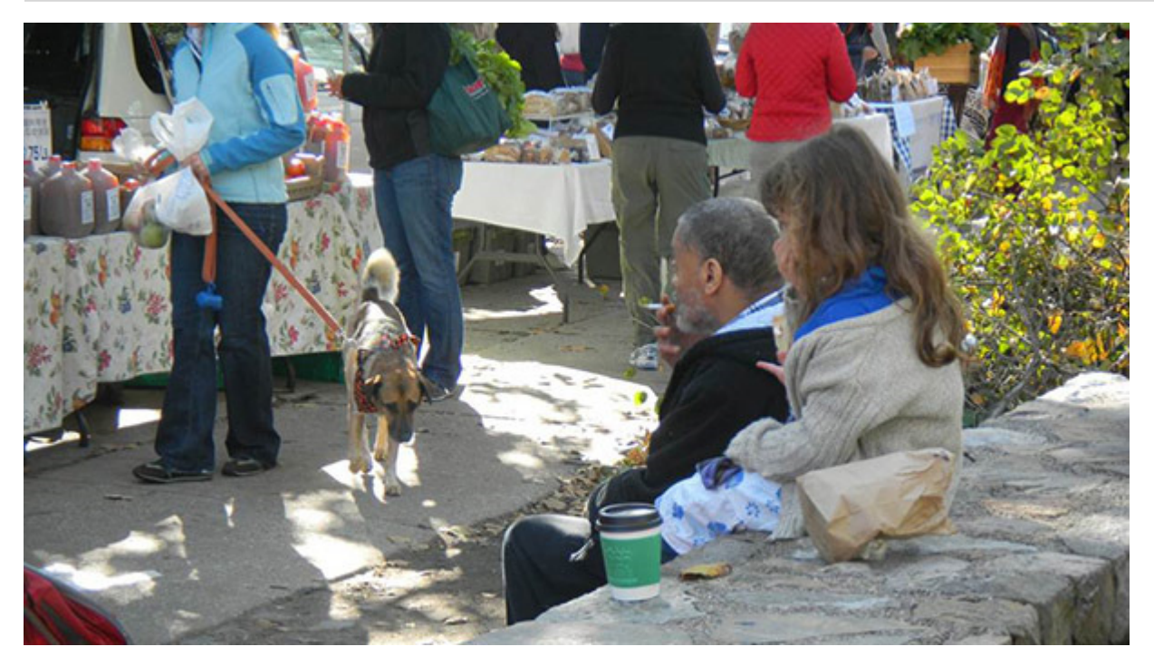
Figure 4. The photo-documentation strategy allowed participants to observe contradictions within the environment — including this image of ambient cigarette smoke at an otherwise health-promoting farmer's market.

Figure 3. Parents described many concerns, including their frustration that it is expensive and time-consuming to prepare healthy meals and their worries that neighborhood conditions are unsafe for active outside play.