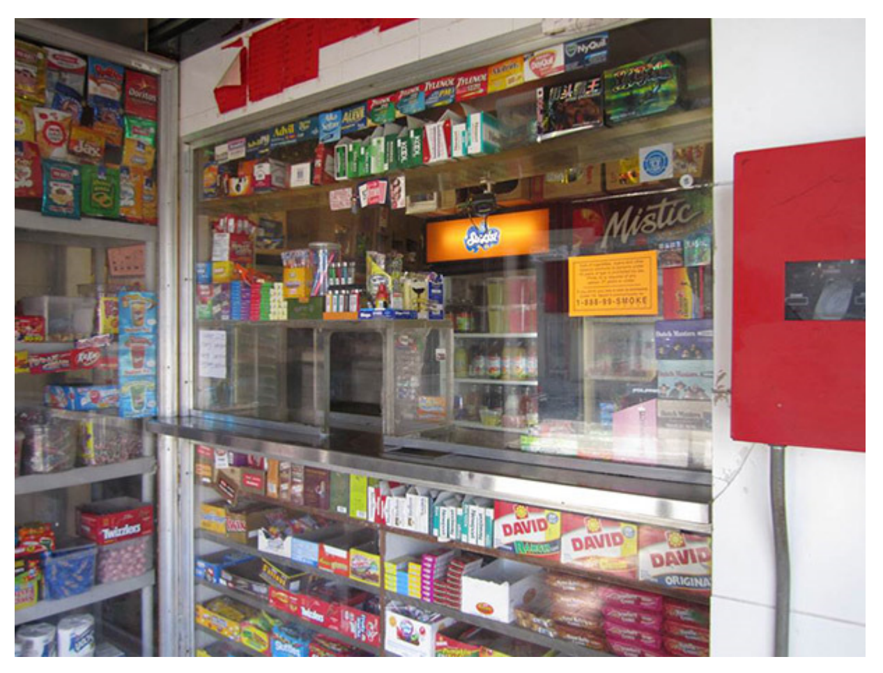
Figure 7. Philadelphia residents often complained about the sale of "loosies" — single cigarettes that are cheap enough for young people to purchase, offering an inexpensive introduction to tobacco.

Without specific prompts from the interviewer, participants spontaneously described health concerns in terms that were consistent with an ecological model. This was especially true in participants' photographs and commentary regarding nutrition and physical activity. For nutrition and physical activity, participants proposed interventions that were equally distributed across all levels of the ecological model. Participants proposed tobacco-use-related interventions less often, and the proposals were concentrated in local community and neighborhood (23%) and policy (50%) levels of the ecological model (Tables 2 and 3).