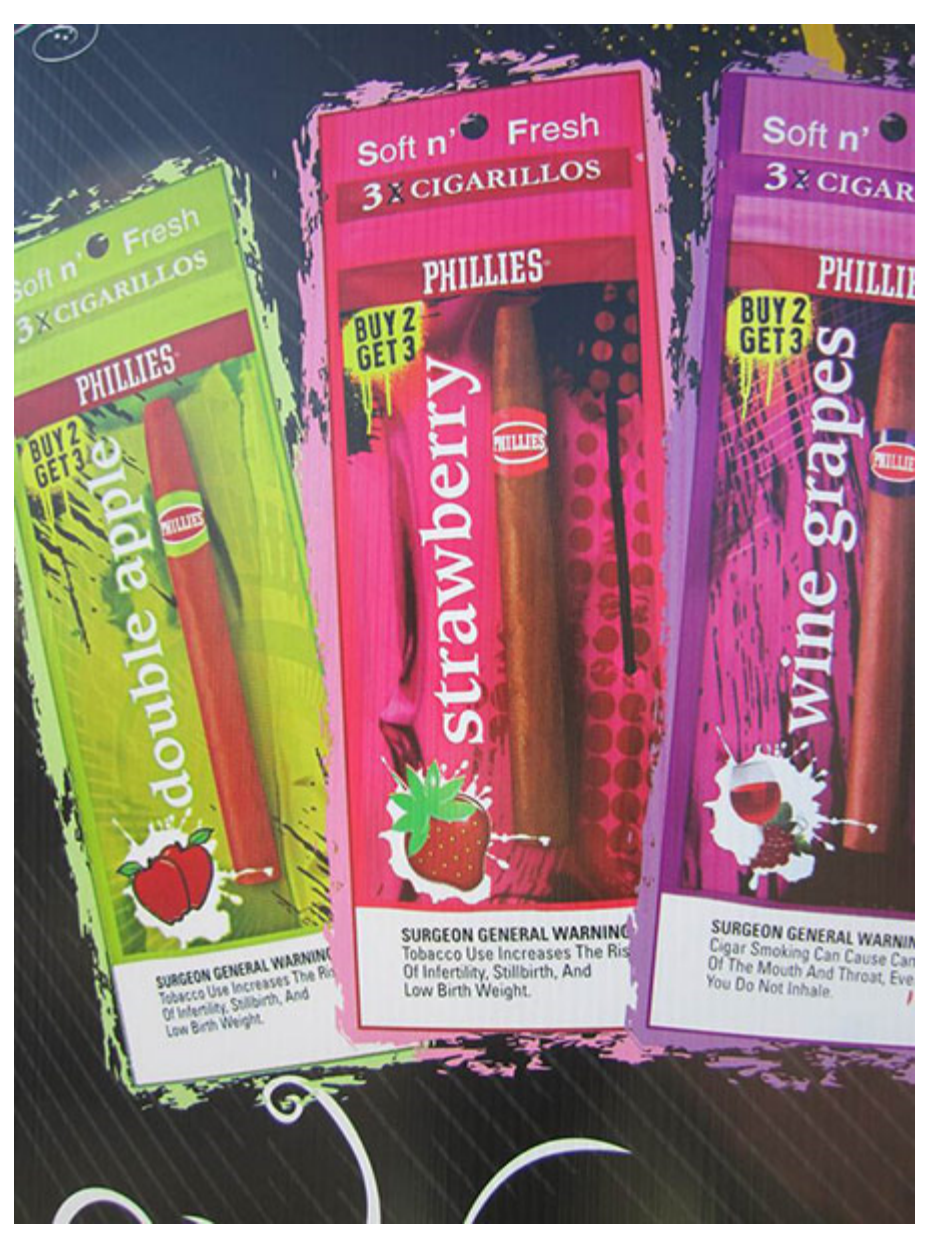
Figure 6. Participants described their concern — and in some cases their anger — about marketing of tobacco to youth.