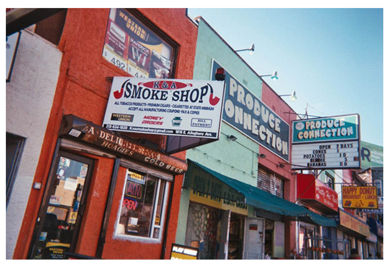
Figure 5. Multiple participants photographed tobacco outlets and lamented how common they are across the city.