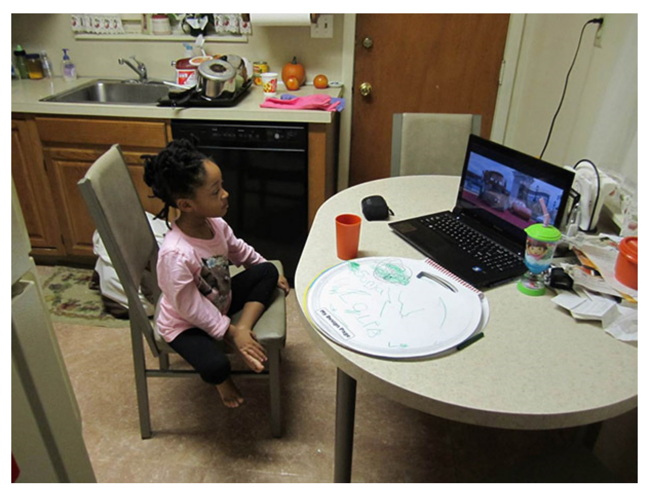
Figure 3. Parents described many concerns, including their frustration that it is expensive and time-consuming to prepare healthy meals and their worries that neighborhood conditions are unsafe for active outside play.