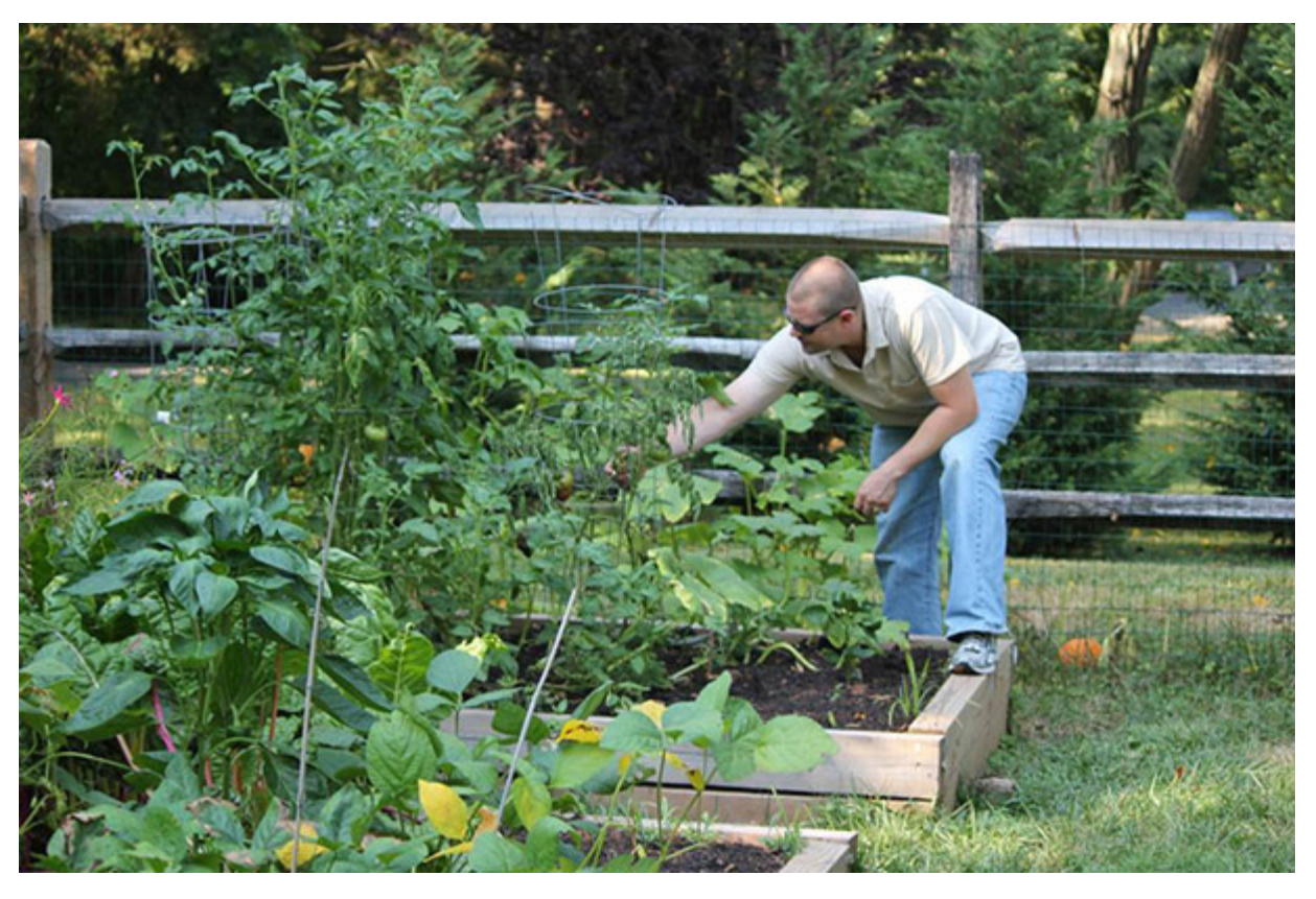
Figure 2. Urban gardening was described as a promising strategy to promote improved nutrition for both youth and adults.