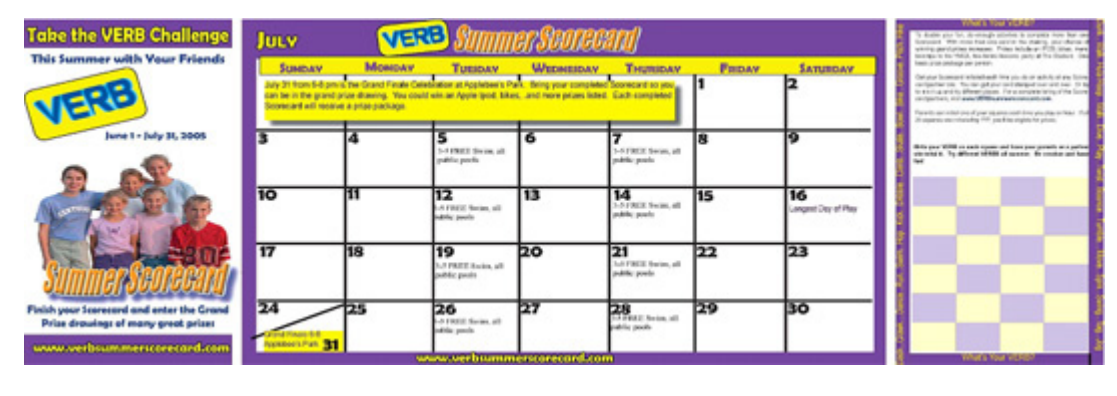
Figure 1. The VERB Summer Scorecard for 2005.

donated by local merchants or other sponsoring organizations, each of which had a PA theme (eg, Frisbee, beach towel, water bottle). Tweens also became eligible for a future "grand prize" — bicycles, martial arts lessons, YMCA memberships, running shoes, and other items that are attractive to tweens. The VSS promotional strategy included media advertise-