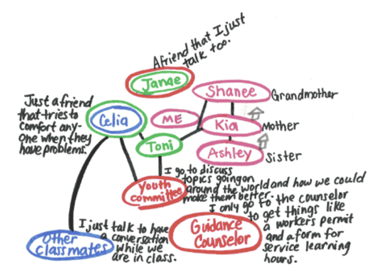
Figure 2. Example of personal network map drawn by a participant in the Shifting the Lens study. (Names have been changed to protect participant identity.)

The personal network maps and audio journals were used to collect data about teens' sources of social support. The personal network maps, which were drawn by the participants, illustrated each teen's perceived network of social support. The maps included people and places such as family members, friends, schools, and communities