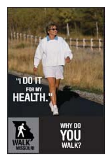
Visit the online version of this article to take a tour of selected print materials from the Walk Missouri campaign

The multimedia campaign took place during a 5-month period from May through September 2003. The media plan consisted of billboard, newspaper, radio, and poster