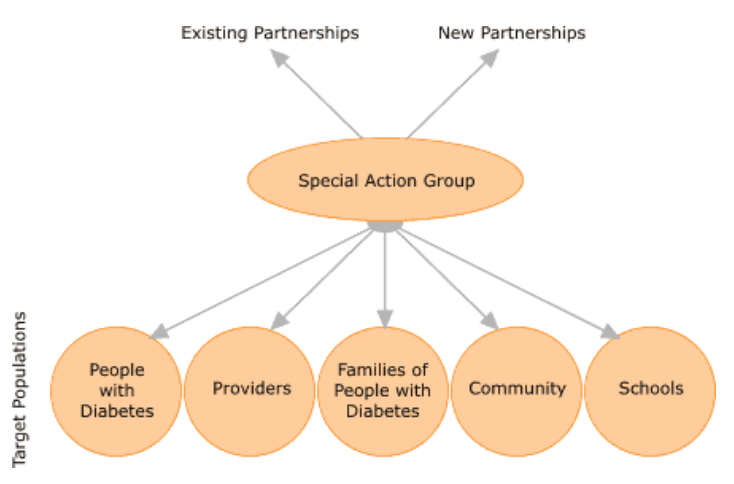
Figure. Model for the Border Health Strategic Initiative, Yuma and Santa Cruz counties, Arizona, 2004. For an interactive version of this graphic, please see the online version of this article.

implement plans for policy and environmental changes. Each case study in this issue of Preventing Chronic Disease pertains to a target population in the model. By clicking on the link in the model, readers will be directed to the case study for that component. The SAG is the "glue" that holds all the components together. Promotores de salud were key to all but the provider and school components.