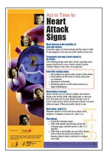
Figure 1. Act in Time poster developed by the National Institutes of Health to provide information on warning signs of heart attack and importance of calling 911 for emergency medical services.

Based on the original content of the Rapid Early Action for Coronary Treatment (REACT) research program developed by the National Institutes of Health (NIH), the Act in Time campaign provides information on the warning signs of heart attack and the importance of calling 911 for emergency medical services