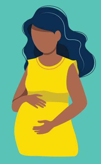
During pregnancy, women may be more prone to gum disease and cavities.