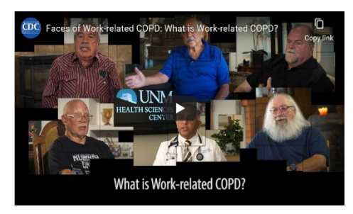
Thumbnail for a Faces of COPD video.

The NORA Musculoskeletal Health Council posted a list of ergonomic guidance documents on the International Ergonomics Association's Musculoskeletal Disorders Technical Committee <a href="website">website</a>. The list links to more than 100 documents with interventions for reducing the risk factors for workplace musculoskeletal disorders. Information on these activities was also presented at the Human Factors and Ergonomics Society annual meeting held virtually in October 2020.