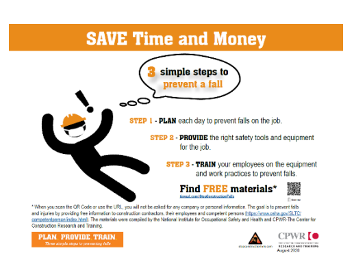
Fall prevention postcard for small businesses

The NORA Construction Council continues to actively participate in the National Campaign to Prevent Falls in Construction. The signature annual event of the campaign, the National Safety Stand-Down to Prevent Falls in Construction was hosted virtually for the first time. To support this event, the Construction Council falls campaign workgroup helped develop 11 fall prevention related infographics in 2020. Members also contributed to a postcard and new website for small business contractors (less than 20 employees) in both English and Spanish. Several council members distributed these small business fall prevention postcards to their local permitting offices