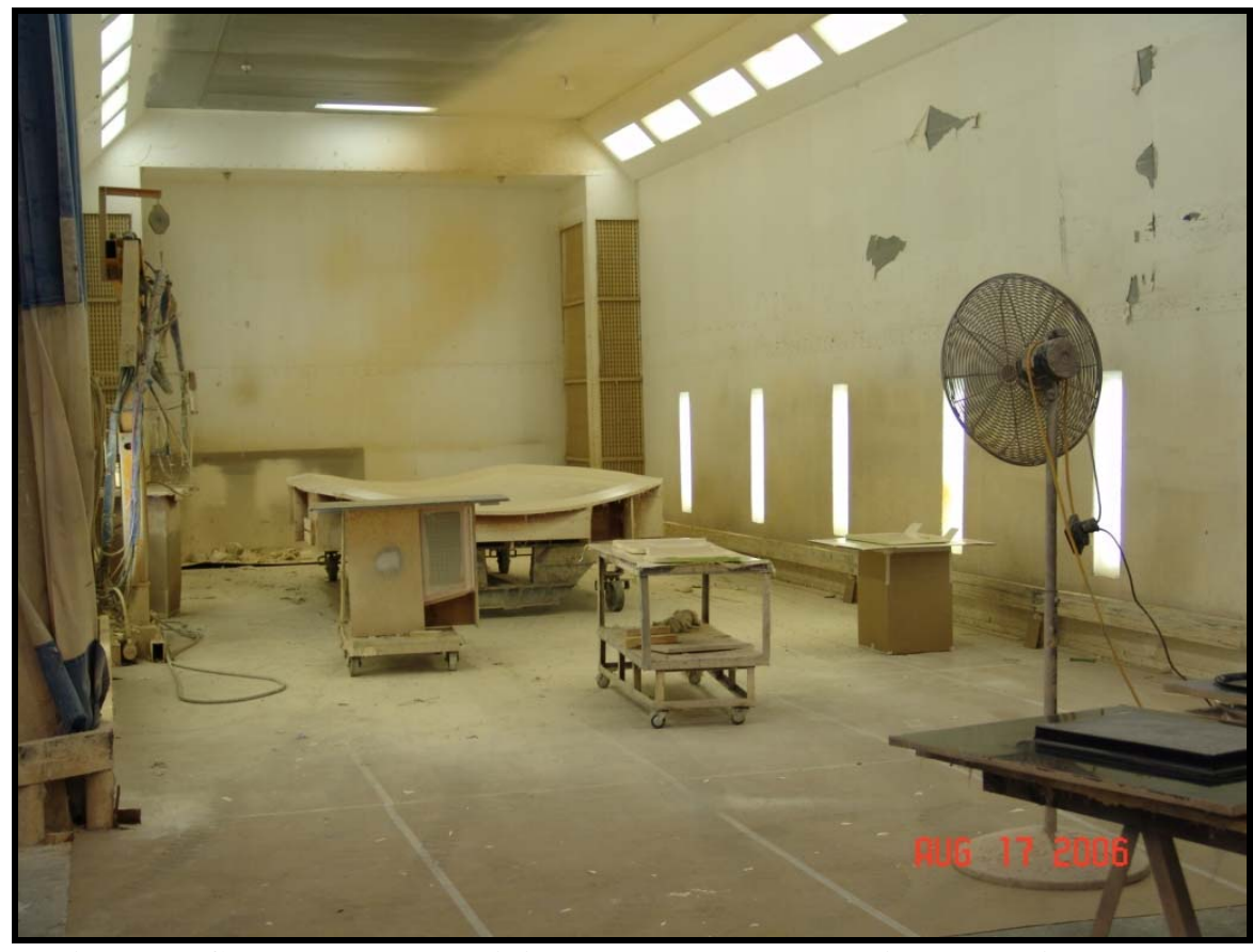
Figure 2: Gelcoat booth containing small part molds during the curing process