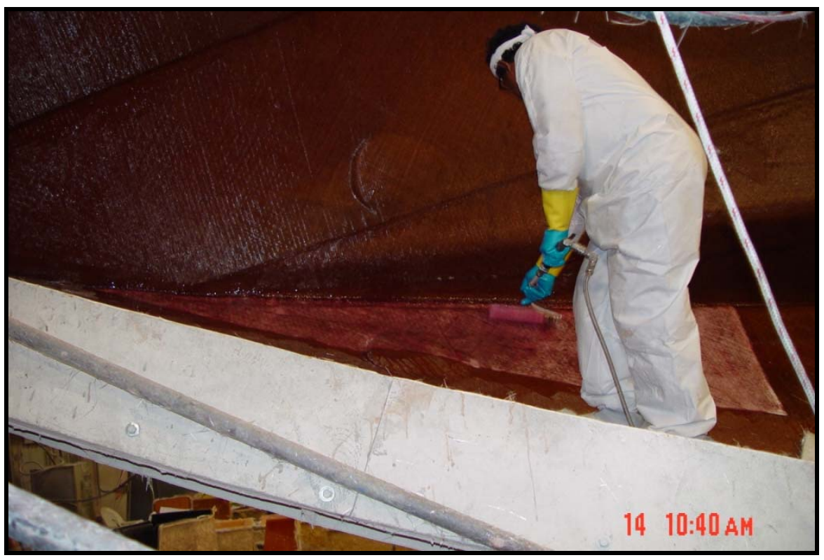
Figure 3: Large part laminator releasing resin using the pressure-fed perforated rollers

Additional layers of fiberglass cloth saturated with resin are added in layers until the part attains its final desired thickness. These layers are compressed by rolling the top surface by hand. During deck lamination, a six inch metal rolling head attached to a wooden handle is used to eliminate any air pockets between the layers of resin-saturated fiberglass. Nearly twice as much resin is used to laminate hulls as is used on decks. A table displaying the resin usage for each section of the boat can be found in Table 2. A unique aspect of sailing yachts is the keel cavity that is deeper in sailboats than most other FRP boats. The keel is manufactured as part of the hull. This keel is problematic during lamination; potentially causing high exposures.