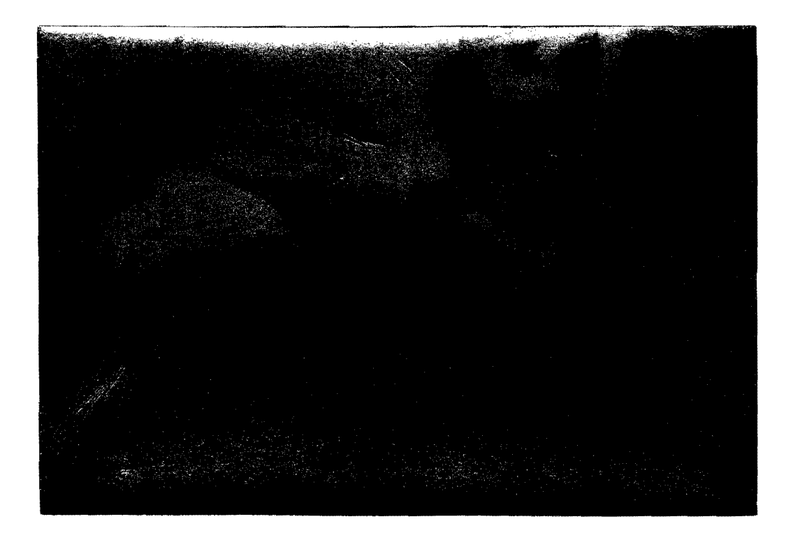
Figure 1 Local Exhaust of Friction Material Gluing