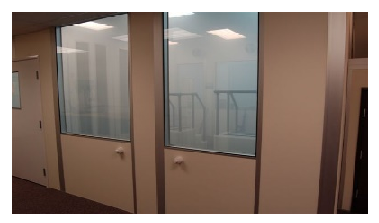
Figure 6: Charged Test Chamber