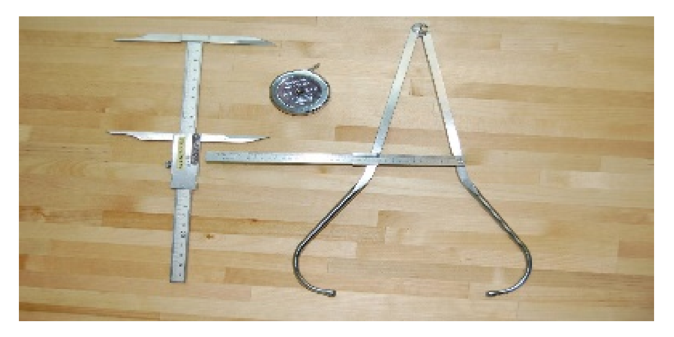
Figure 7: Facial Size Measurement Calipers