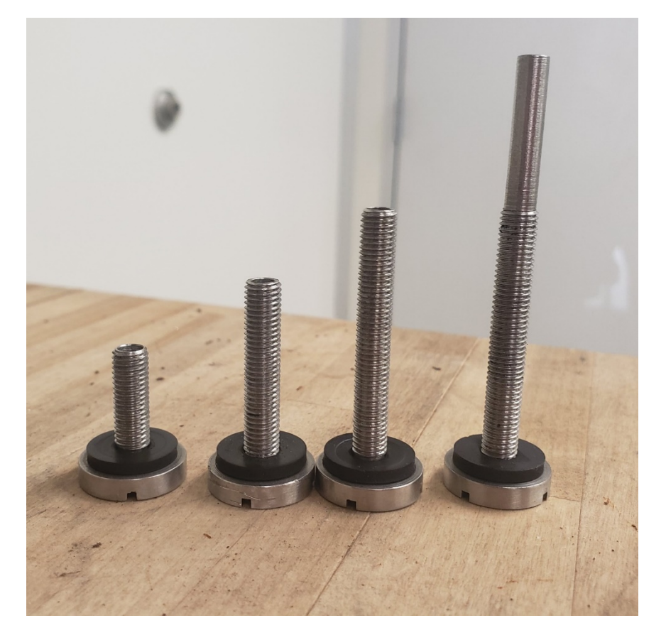
Figure 10: View of Sample Probe – Various lengths