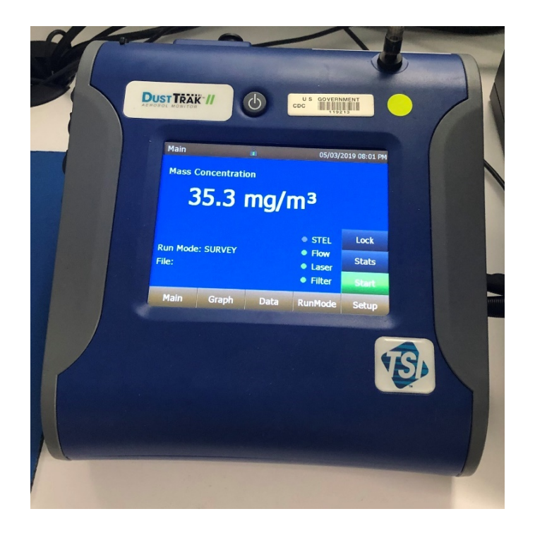
Figure 3: DustTrak II Aerosol Monitor