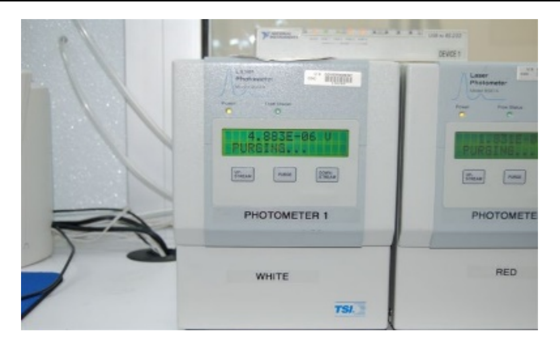
Figure 1: Laser Photometer, Model 8587A