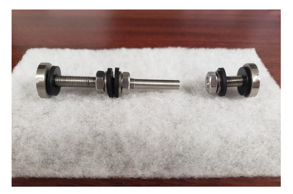
Figure 11: Sample Probe View Set Up as – Double (left) and Single (right)