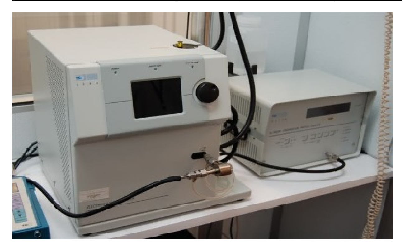
Figure 5: Scanning Mobility Particle Sizer