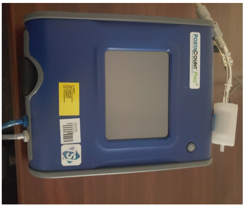
Figure 4: TSI PortaCount Model 8038