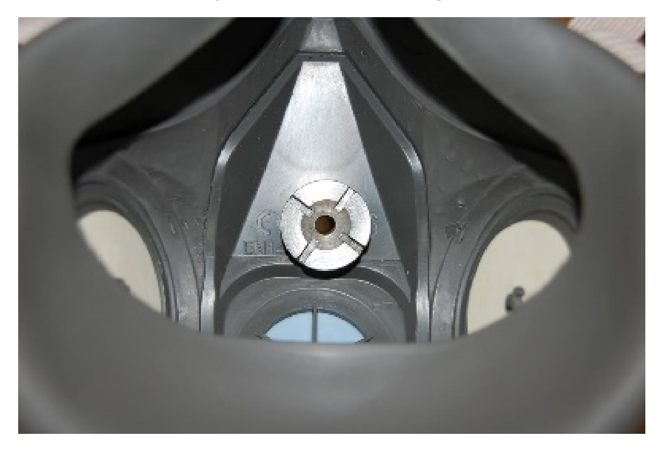
Figure 8: Interior View of a Probed Sample Respirator