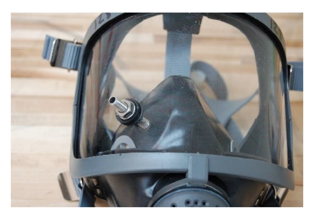
Figure 9: Exterior View of a Probed Sample Respirator