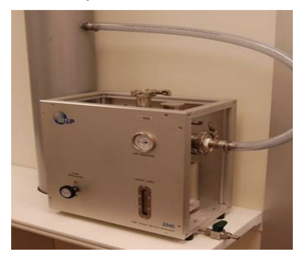
Figure 2: Aerosol Generator