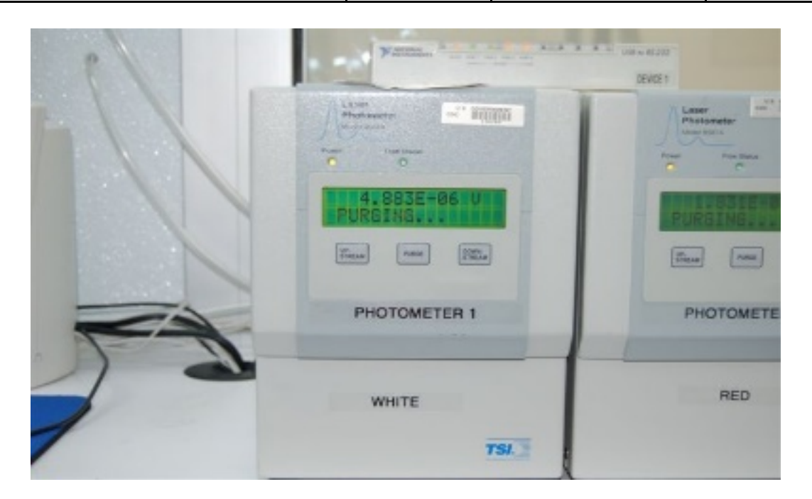
Figure 1: Laser Photometer, Model 8587A