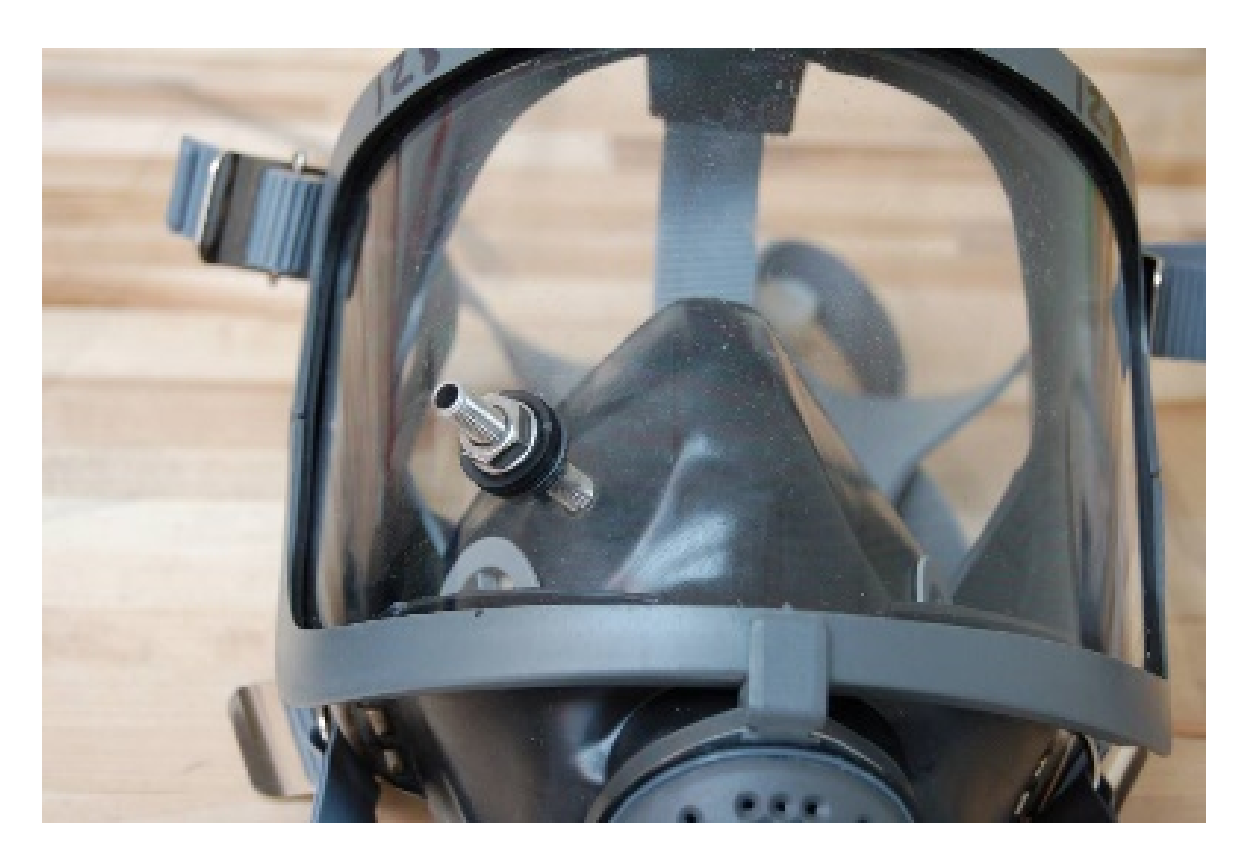
Figure 9: Exterior View of a Probed Sample Respirator