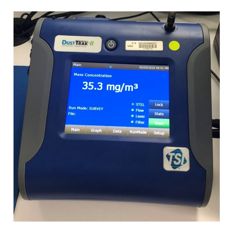
Figure 3: DustTrak II Aerosol Monitor