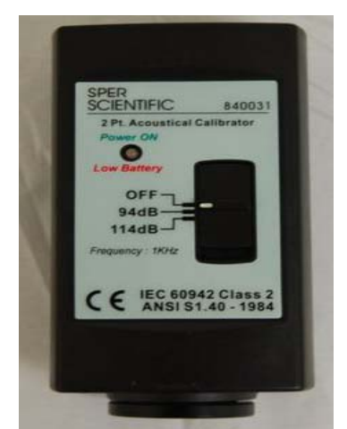
Figure 4. Acoustical calibrator (Sper Scientific model 840031)

3.2.8. Sper Scientific, LTD Acoustical calibrator (model 840031) or equivalent is used to calibrate the sound level meters.