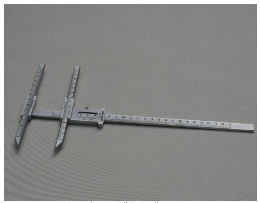
Figure 1: Sliding Calipers

Figure 1: Sliding Calipers Figure 2: Spreading Calipers