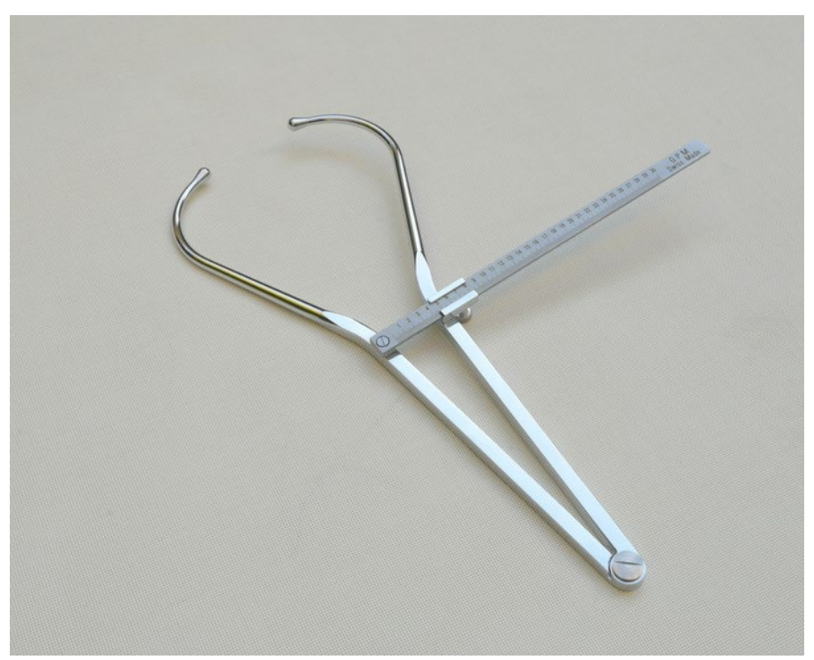
Figure 2: Spreading Calipers

Procedure No. RCT-APR-STP-0005-05a-06 Revision: 3.1 Date: 27 January 2023 Page 9 of 13