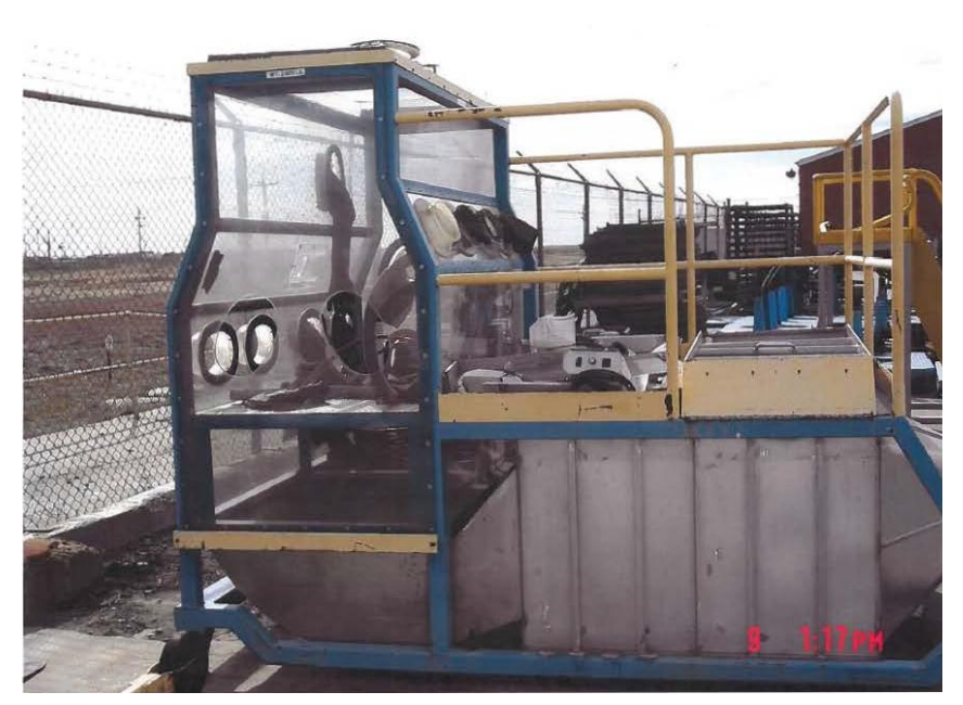
Figure 3. Gloveboxed Downdraft Table, Installed late-1991, for W55 Dismantlement