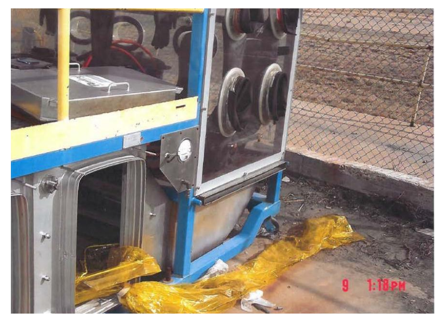
Figure 4. Closeup of Downdraft Table used for W55 Dismantlement