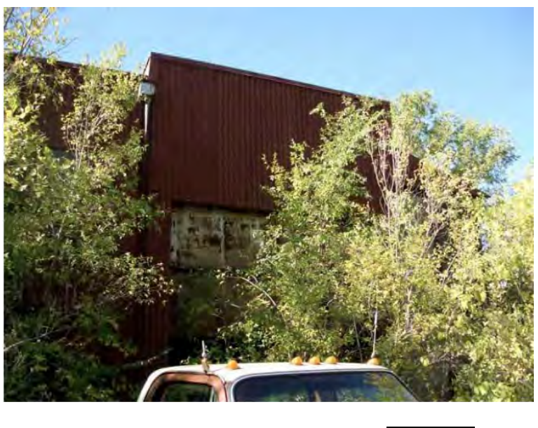
Figure 3. Photo of Old Betatron Building (2007)

The purpose of this calculation is to bound the selected resuspension factor. In reality, there are means of removing the surficial activity other than by resuspension and subsequent exhaust. Thus, the removal rate due to resuspension, \mu_r , is most likely substantially less than \mu , which, according to equation 7, would imply a lower air exchange rate. A higher value of F_r would lead to a still smaller air exchange rate, one that would no longer be realistic. This calculation confirms that F_r = 1 \times 10^{-5} \text{ m}^{-1} constitutes a plausible upper bound.