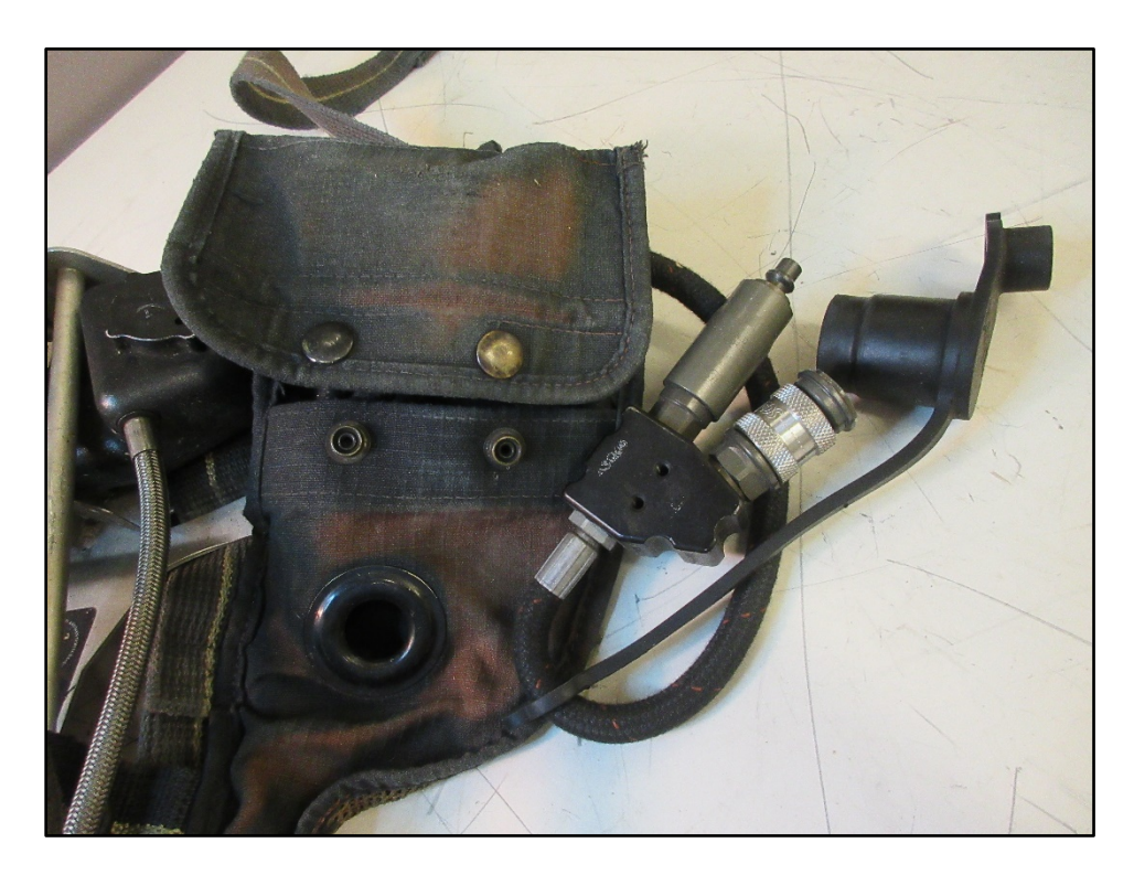
Figure 15: Auxiliary hose connectors with dust hood removed