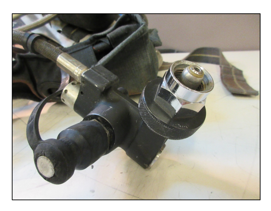
Figure 11: Cylinder attachment and RIC UAC connector