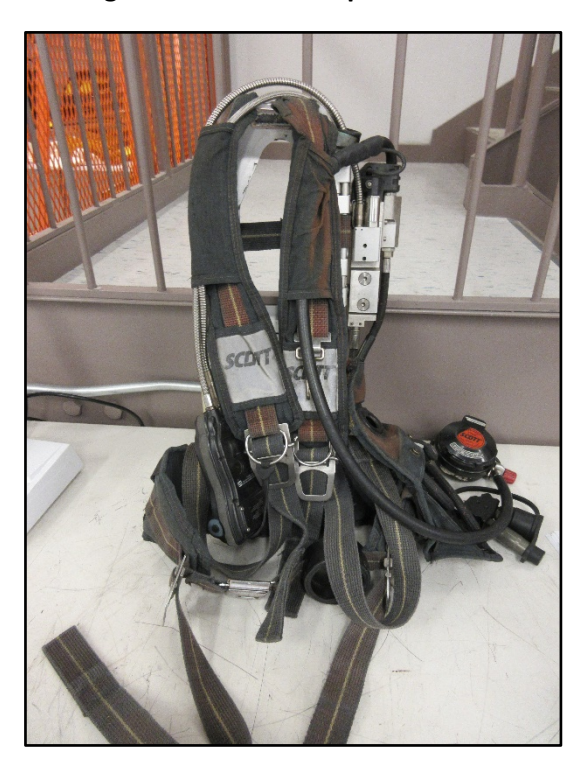
Figure 26: Overall of straps and buckles, dye sublimation on left shoulder strap