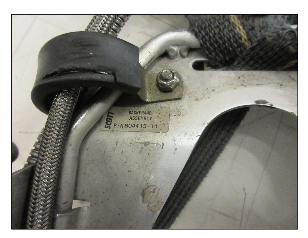
Figure 25: Backframe part number