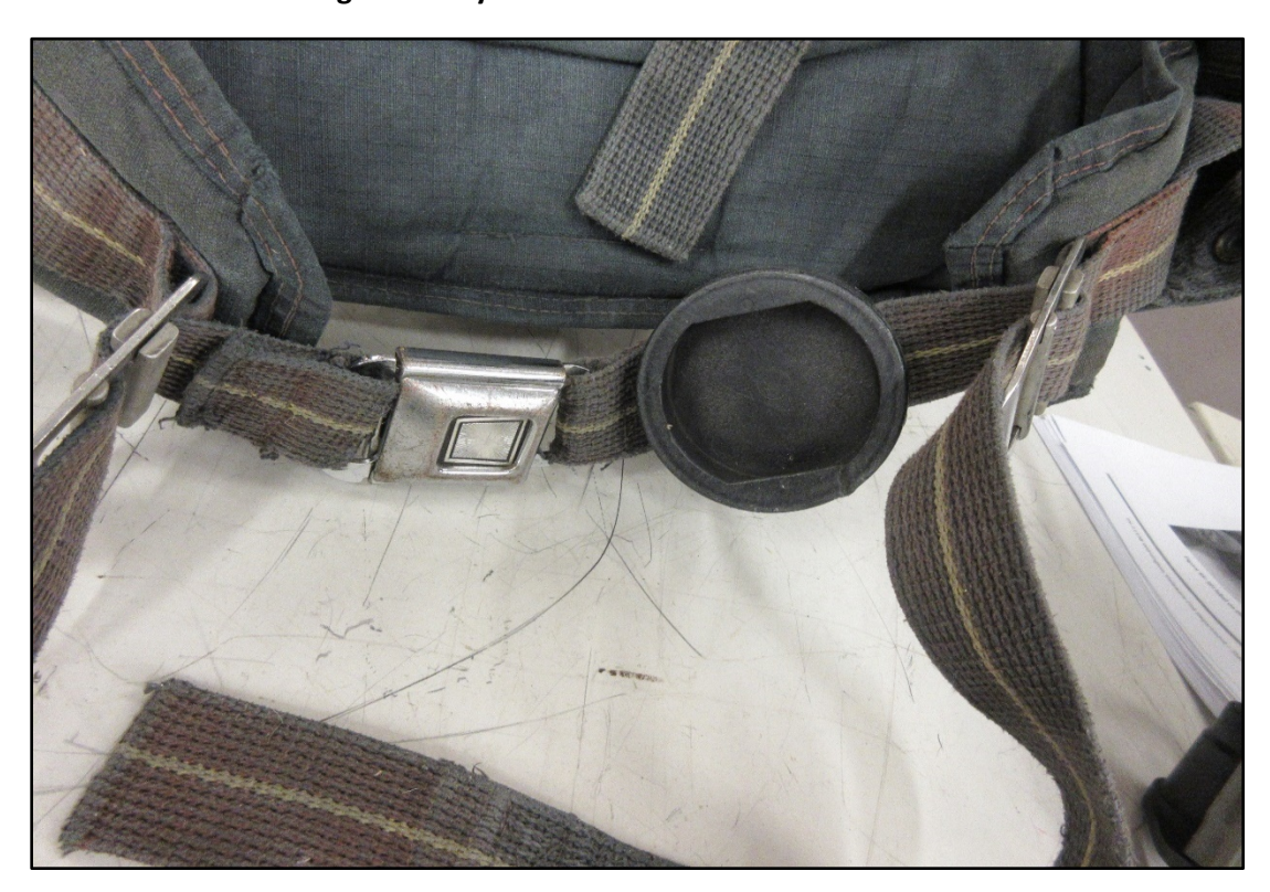
Figure 28: Waist belt completely tightened