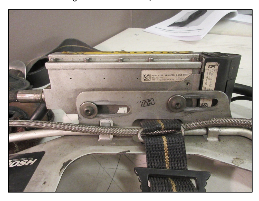
Figure 10: Pressure reducer, inside view