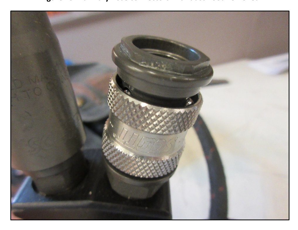
Figure 16: Female adapter stuck in open position