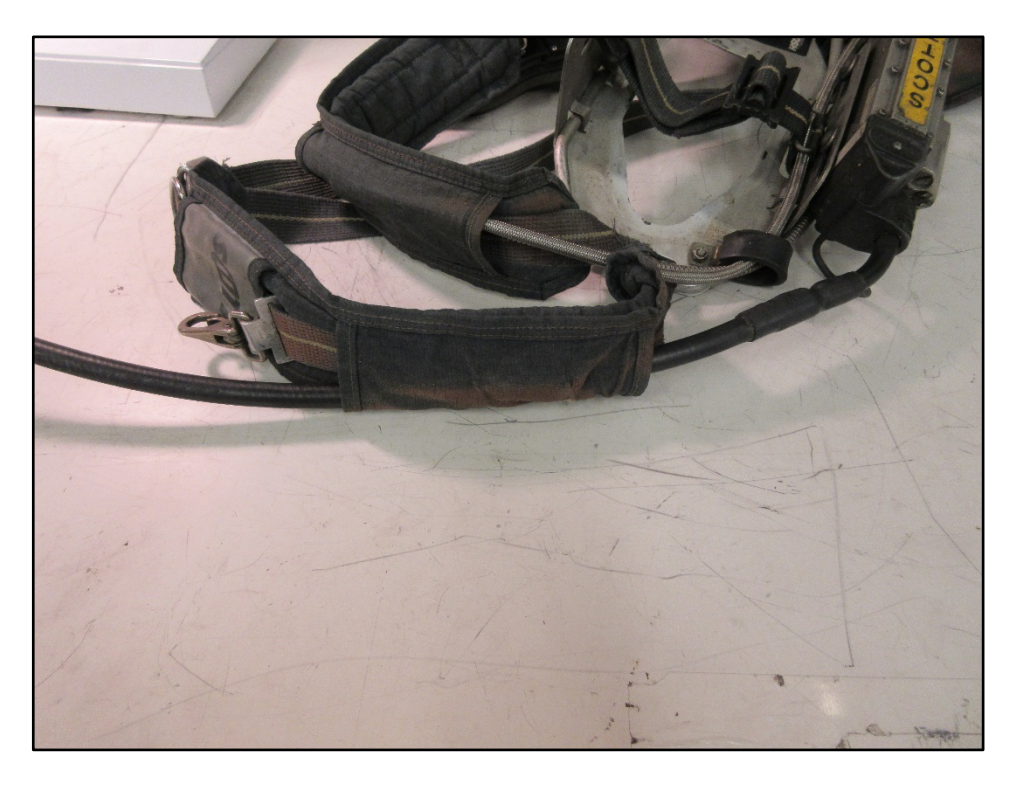
Figure 8: Low pressure hose through shoulder strap TN-21971 East Hartford, Connecticut Fire Department – Status Investigation Report