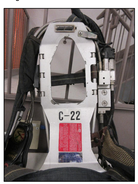
Figure 22: Overall of backframe