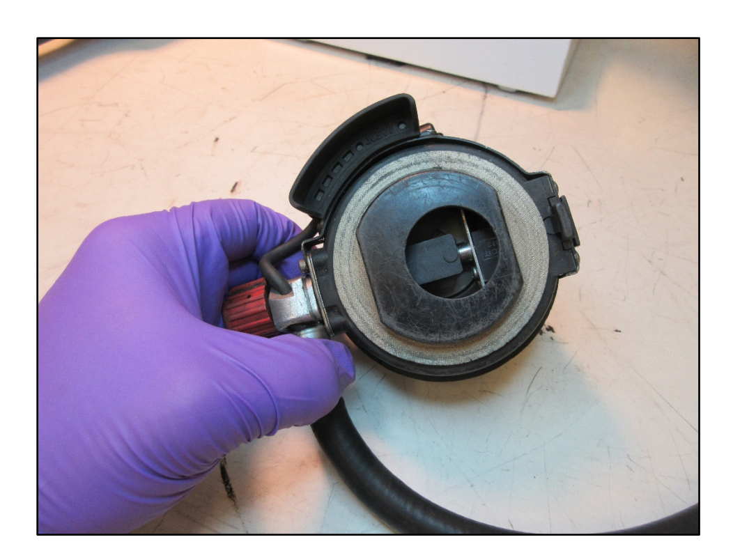
Figure 6: Inside seal of mask mounted regulator and HUD