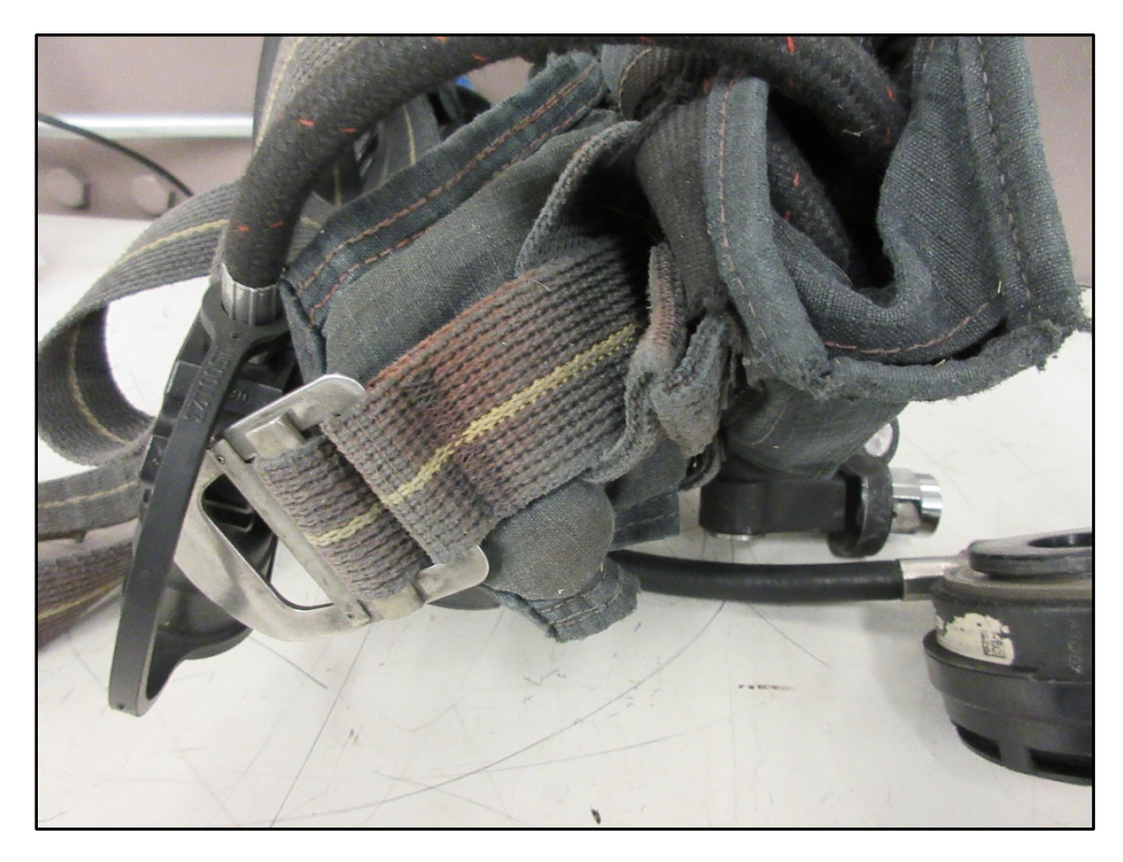
Figure 27: Dye sublimation of left side waist belt