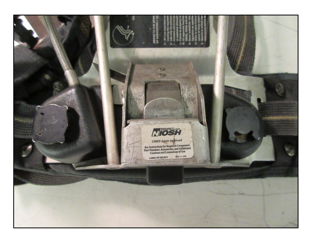
Figure 19: PASS control module under cylinder attachment and CBRN sticker on backframe