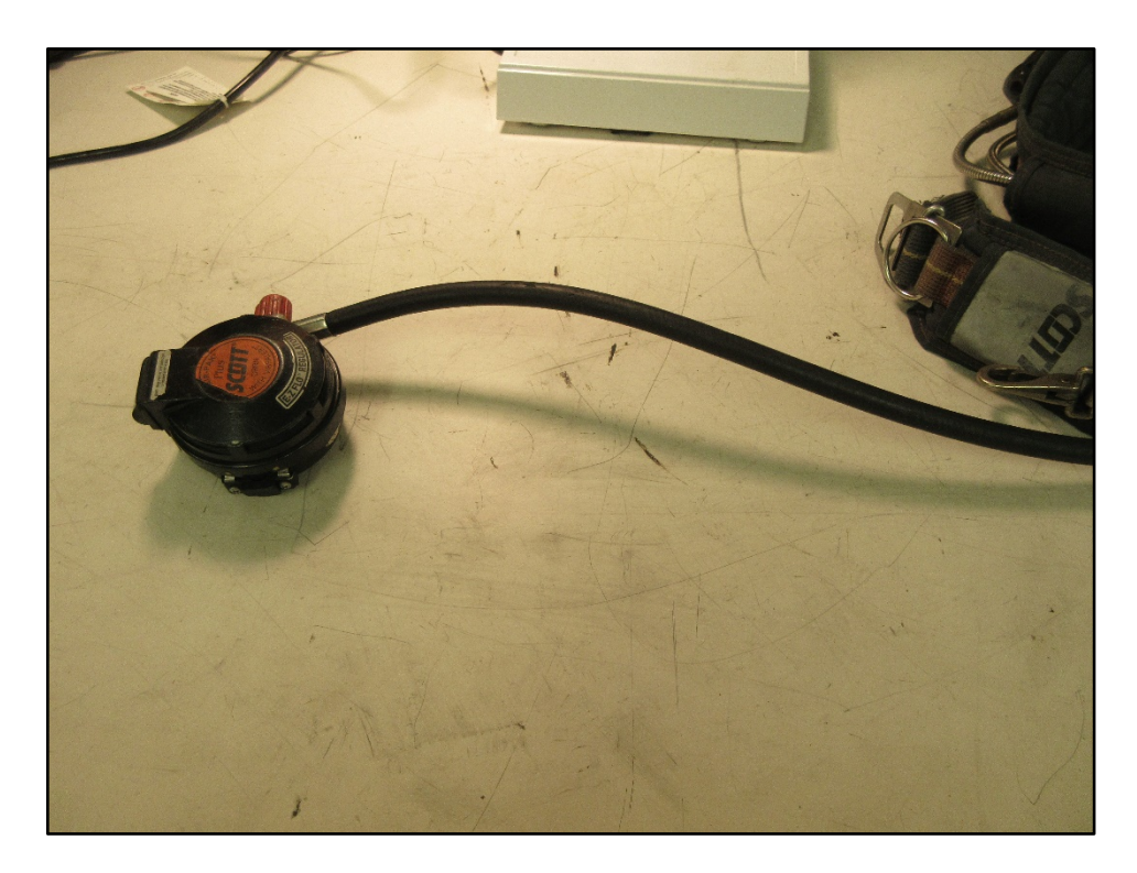
Figure 7: Low pressure hose