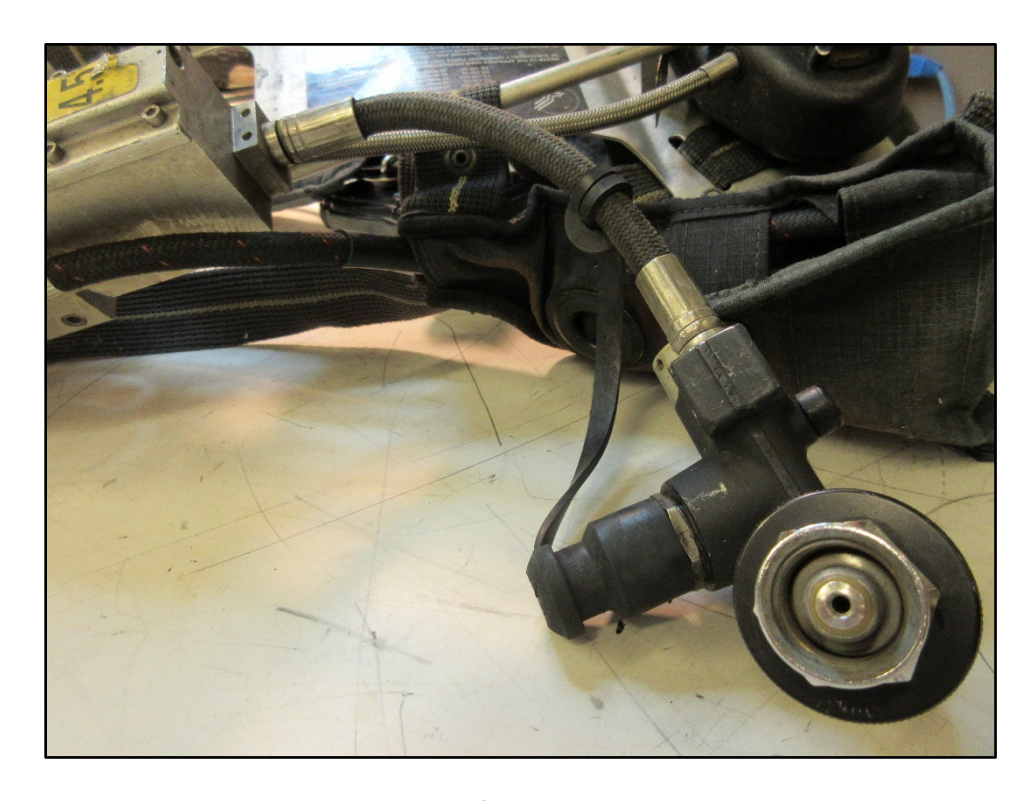
Figure 13: High pressure hose from cylinder attachment to reducer.