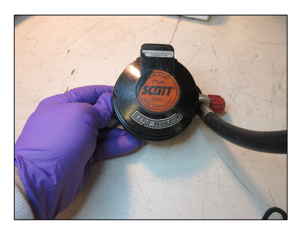
Figure 5: Mask mounted regulator