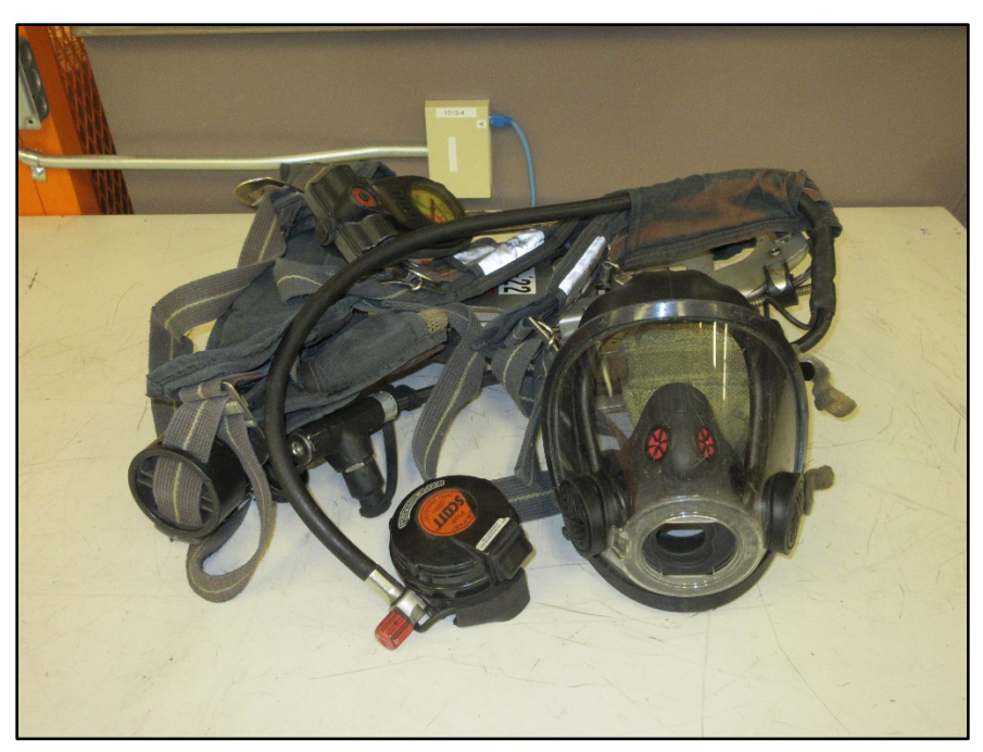
Figure 2: SCBA as received