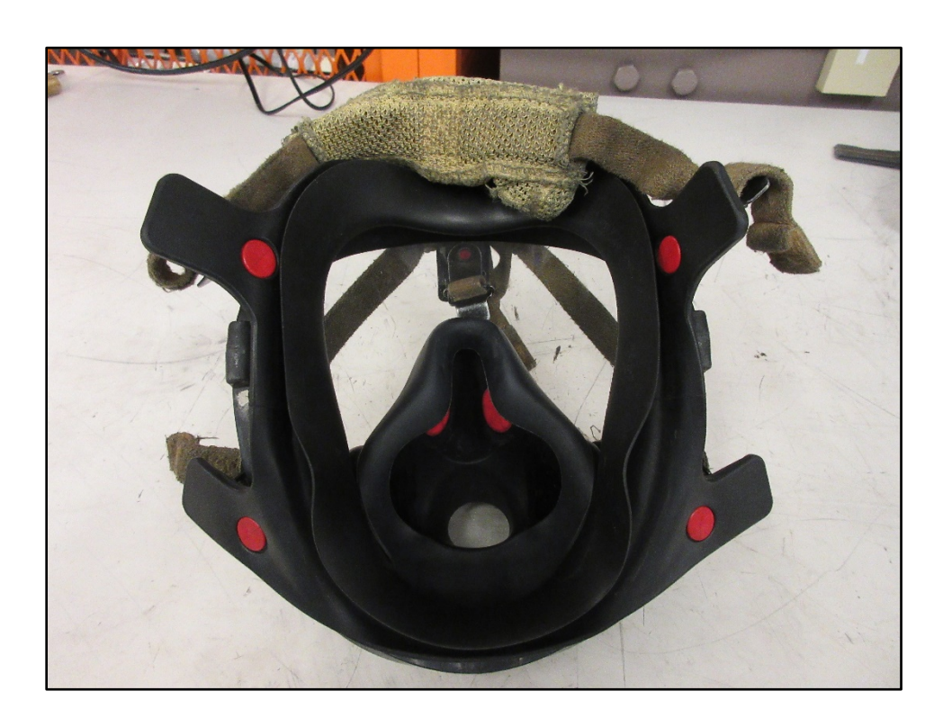
Figure 4: Inside of facepiece