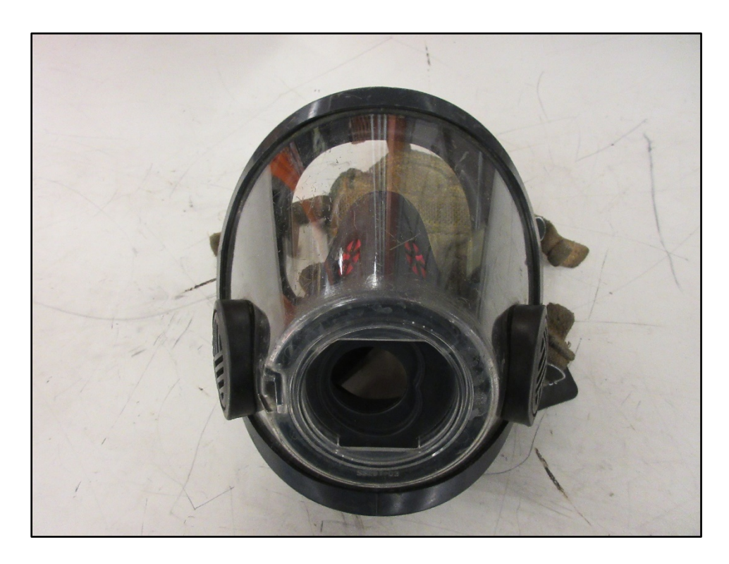
Figure 3: Front of facepiece