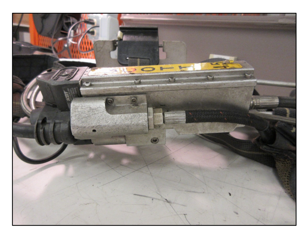
Figure 9: Pressure reducer, outside view