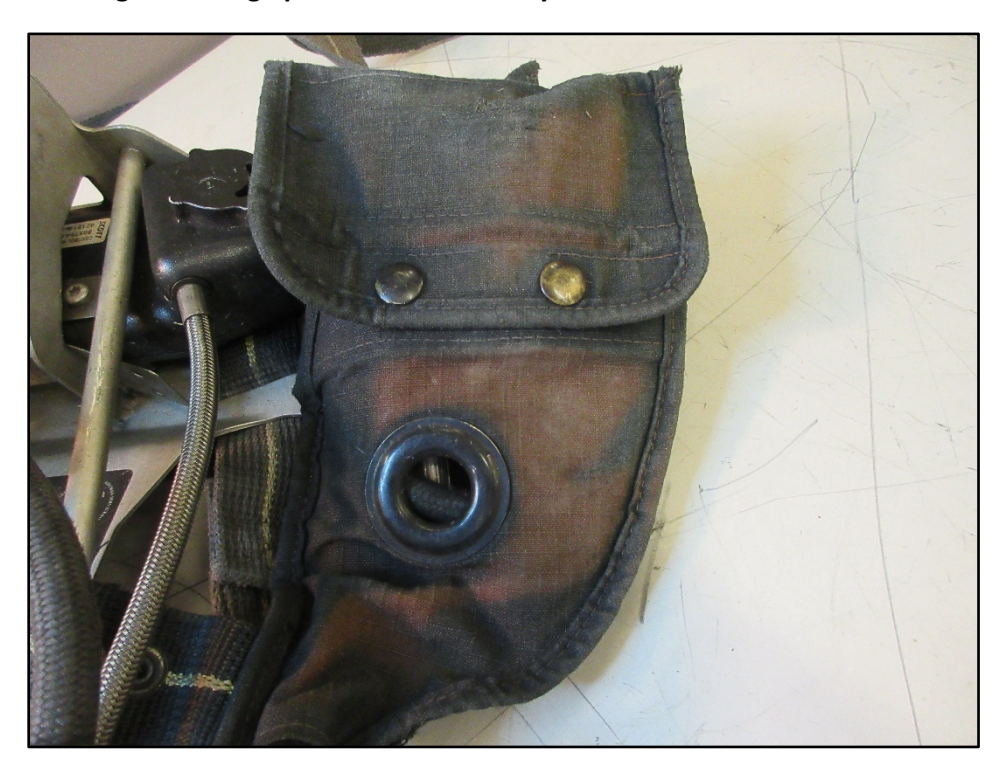
Figure 14: Auxiliary hose pouch