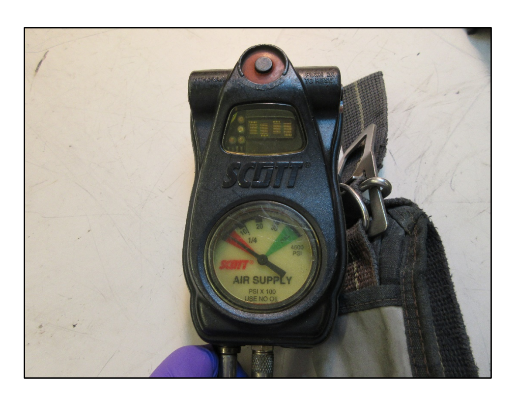
Figure 17: PASS control console