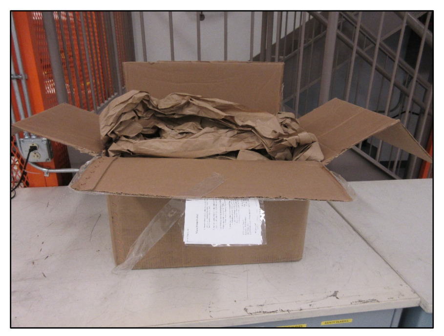
Figure 1: SCBA as received.