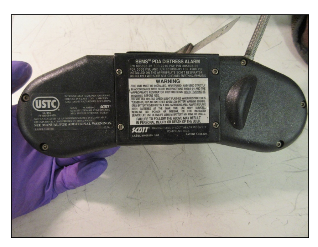
Figure 21: Back of PASS control module