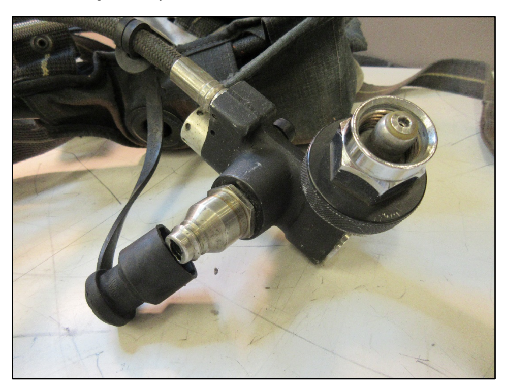
Figure 12: RIC UAC dust cover removed and cylinder attachment O-ring