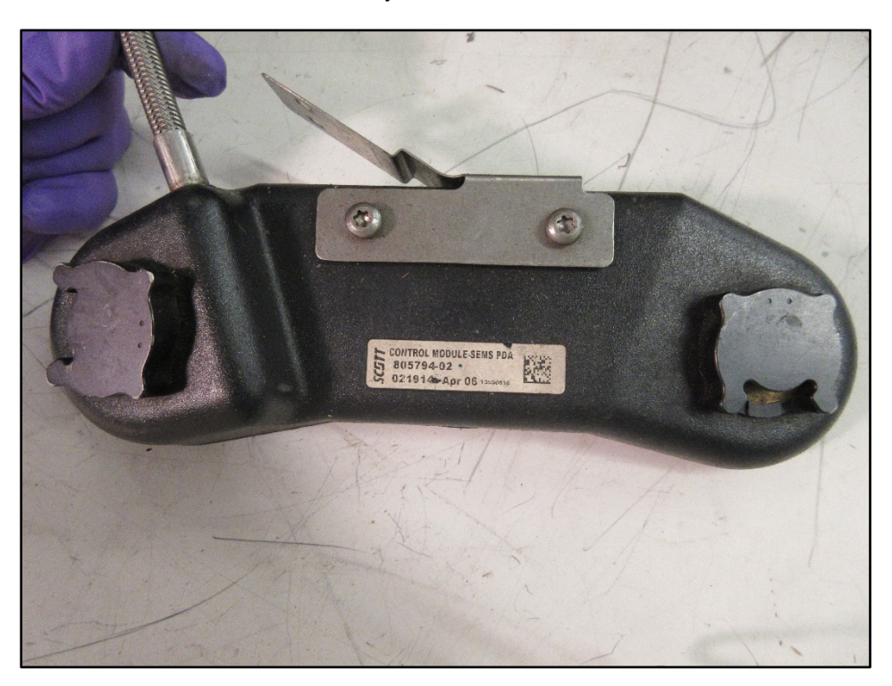
Figure 20: Front of PASS Control module