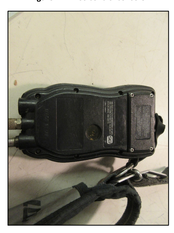
Figure 18: SEI label on back of PASS control console, 1998 edition