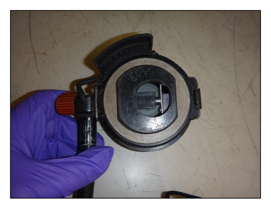
Figure 6: Inside seal of mask-mounted regulator and HUD

TN-25514 Bedford County Fire and Rescue, Virginia – Status Investigation Report