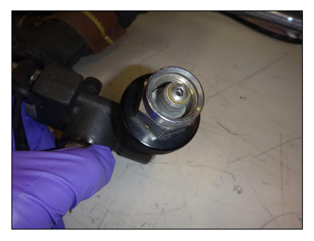
Figure 11: Cylinder attachment and RIC UAC connector