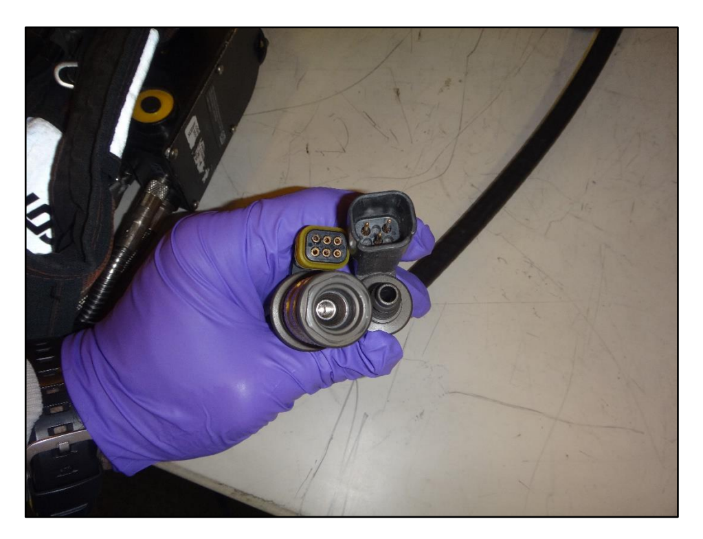
Figure 8: Low-pressure hose quick disconnect

TN-25514 Bedford County Fire and Rescue, Virginia – Status Investigation Report