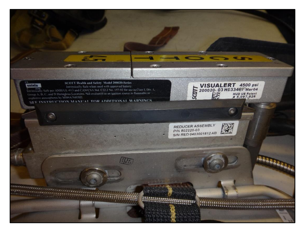
Figure 10: Pressure reducer, inside view