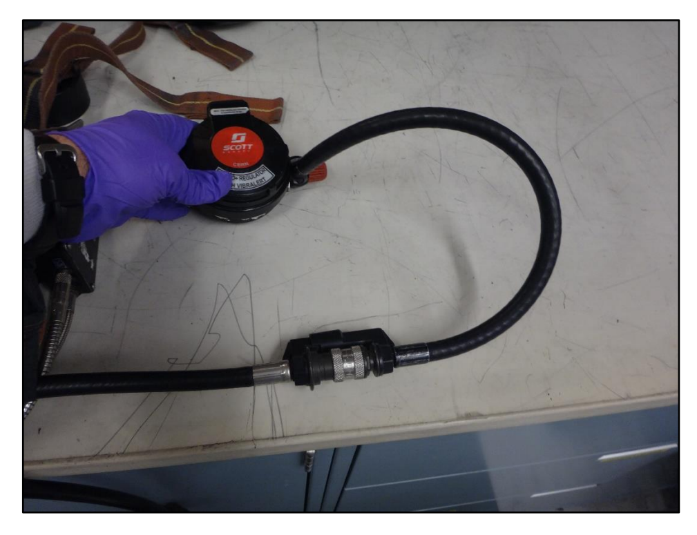
Figure 7: Low-pressure hose