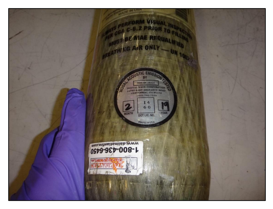
Figure 21: Modal Acoustic Emission testing label and refurbished supplier label