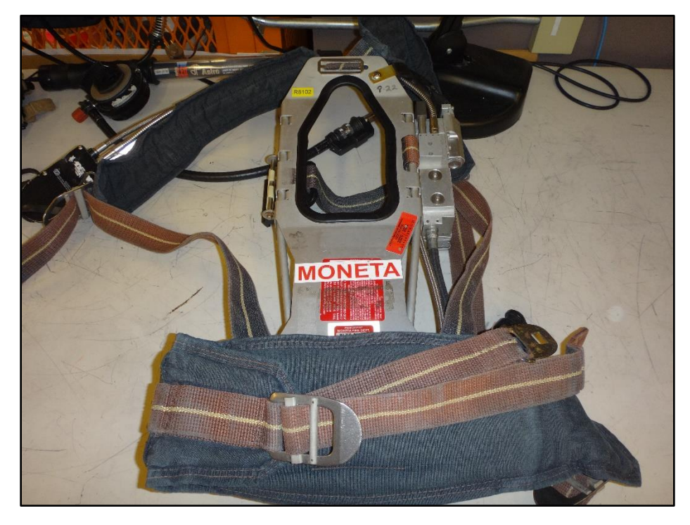
Figure 17: Overall of backframe, SEI label