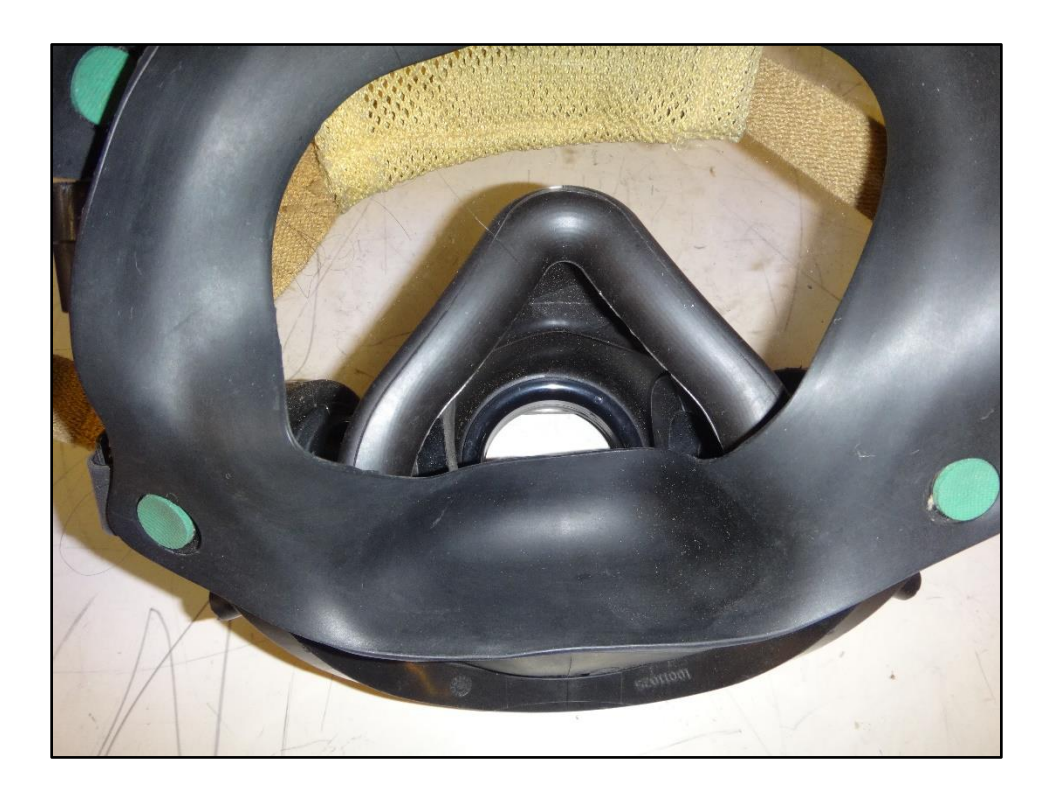
Figure 4: Inside of facepiece