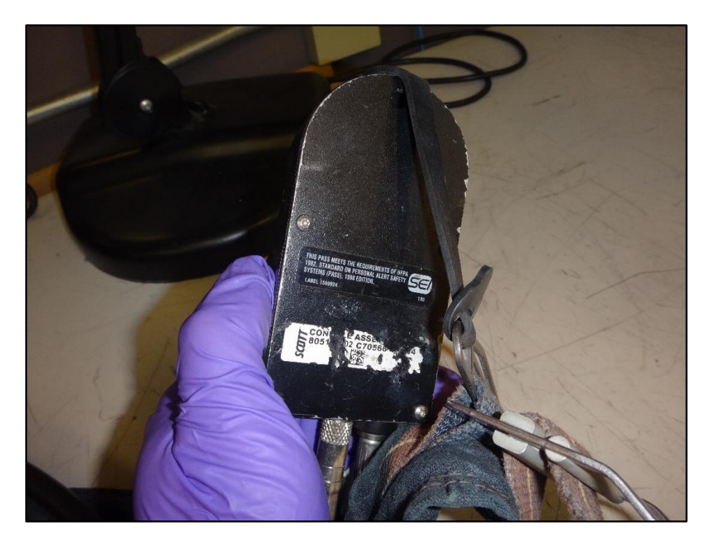
Figure 15: SEI label on back of PASS control console, 1998 edition