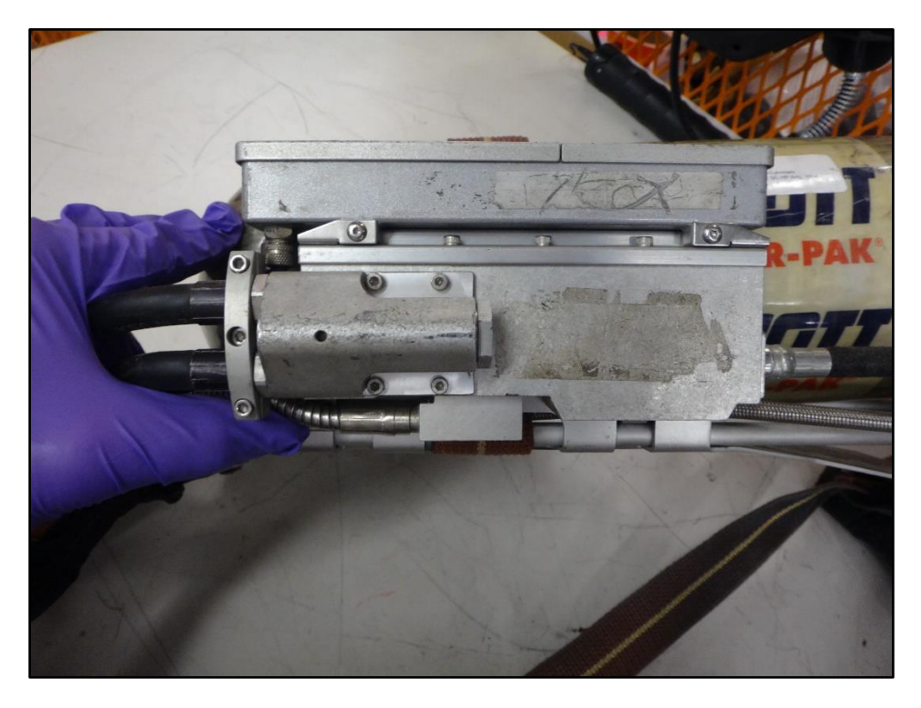
Figure 9: Pressure reducer, outside view