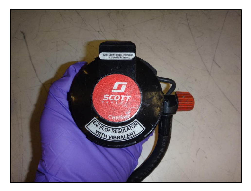
Figure 5: Mask-mounted regulator