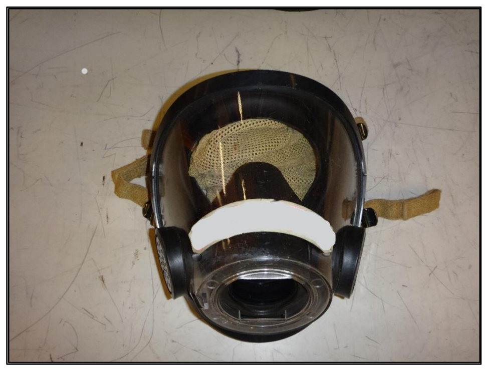
Figure 3: Front of facepiece