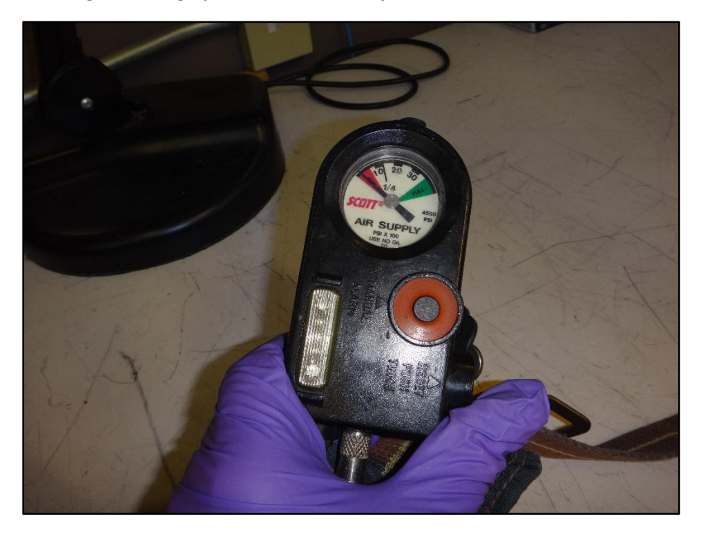
Figure 14: PASS control console