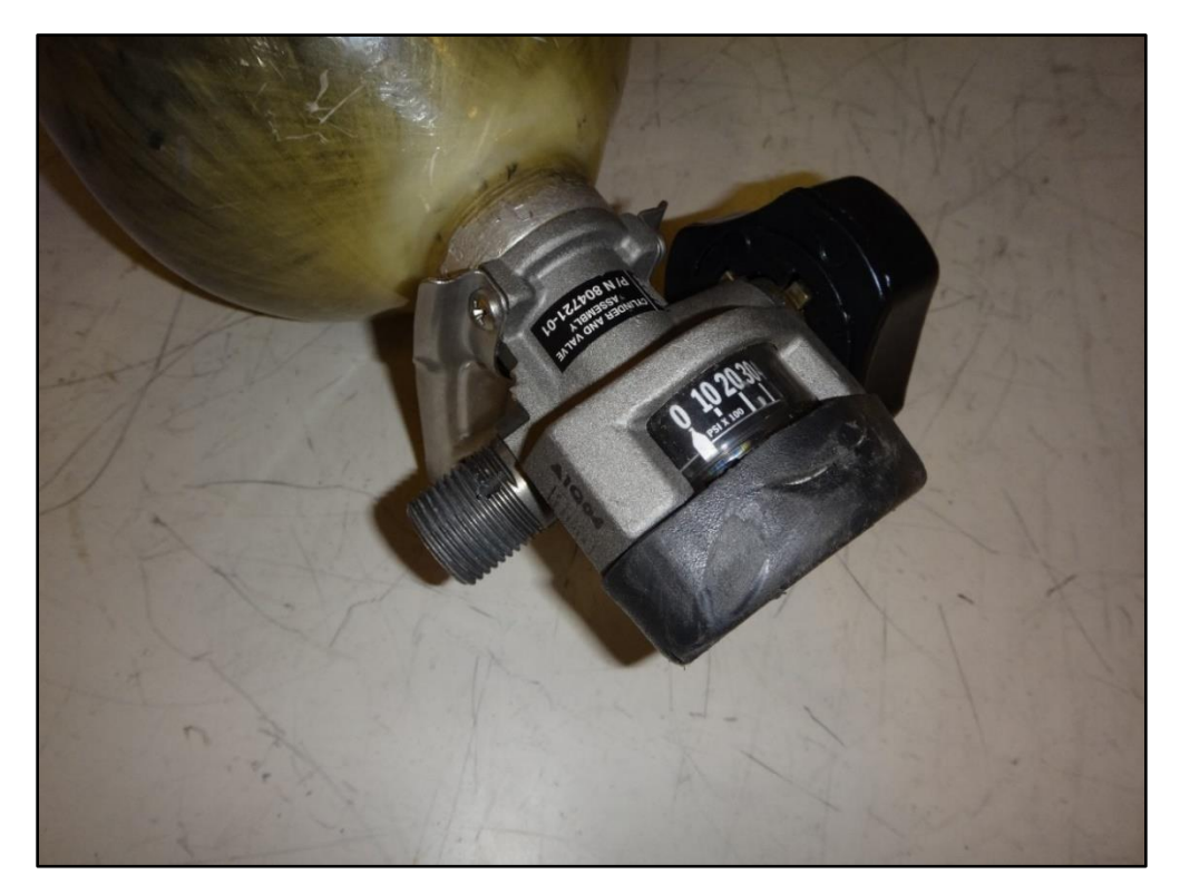
Figure 22: Cylinder valve assembly