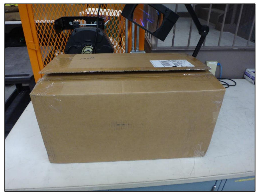
Figure 1: Boxed SCBA as received