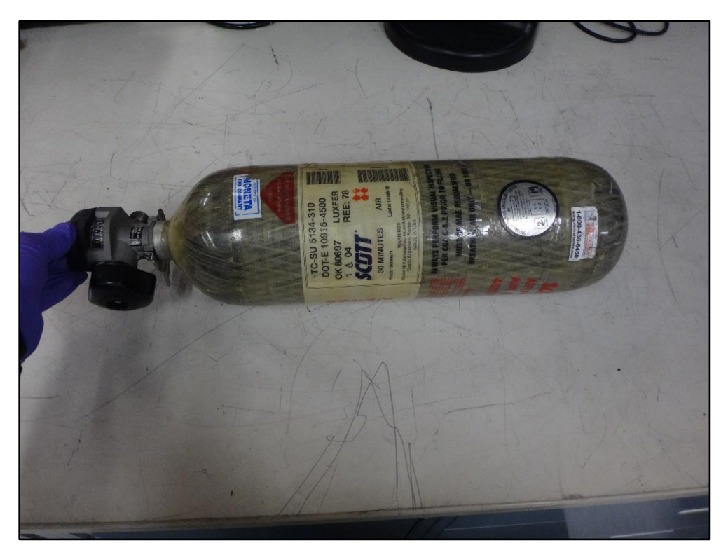
Figure 20: Overall of cylinder