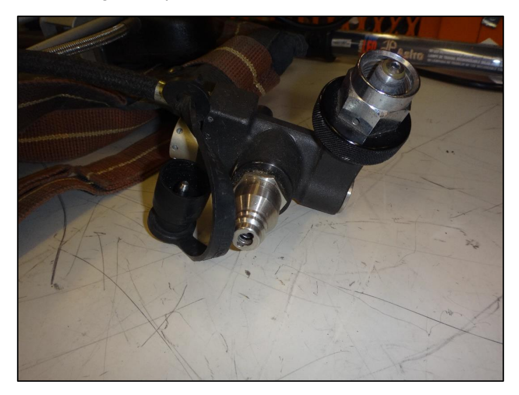
Figure 12: RIC UAC dust cover removed