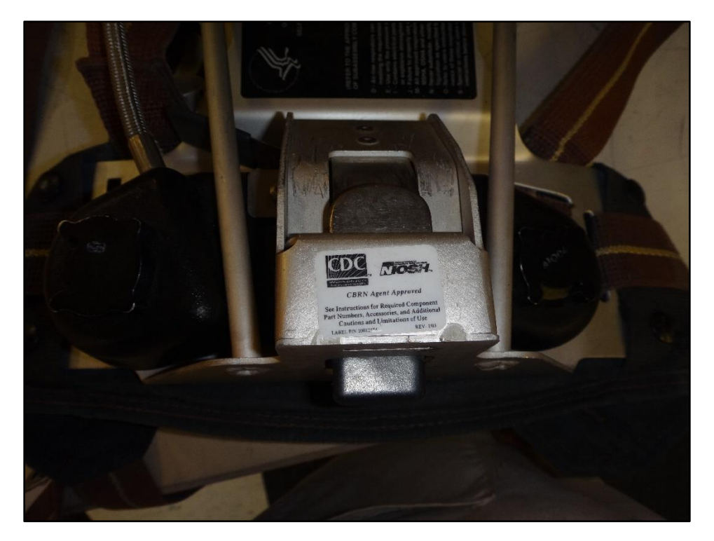
Figure 16: PASS control module under cylinder attachment and CBRN sticker on backframe

TN-25514 Bedford County Fire and Rescue, Virginia – Status Investigation Report