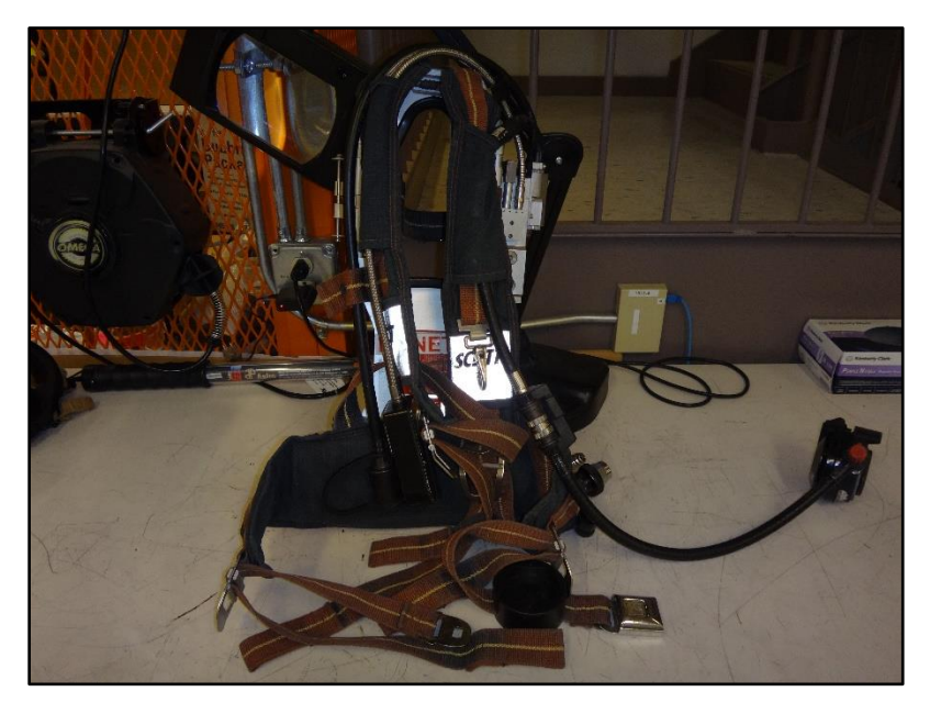
Figure 19: Overall of straps and buckles