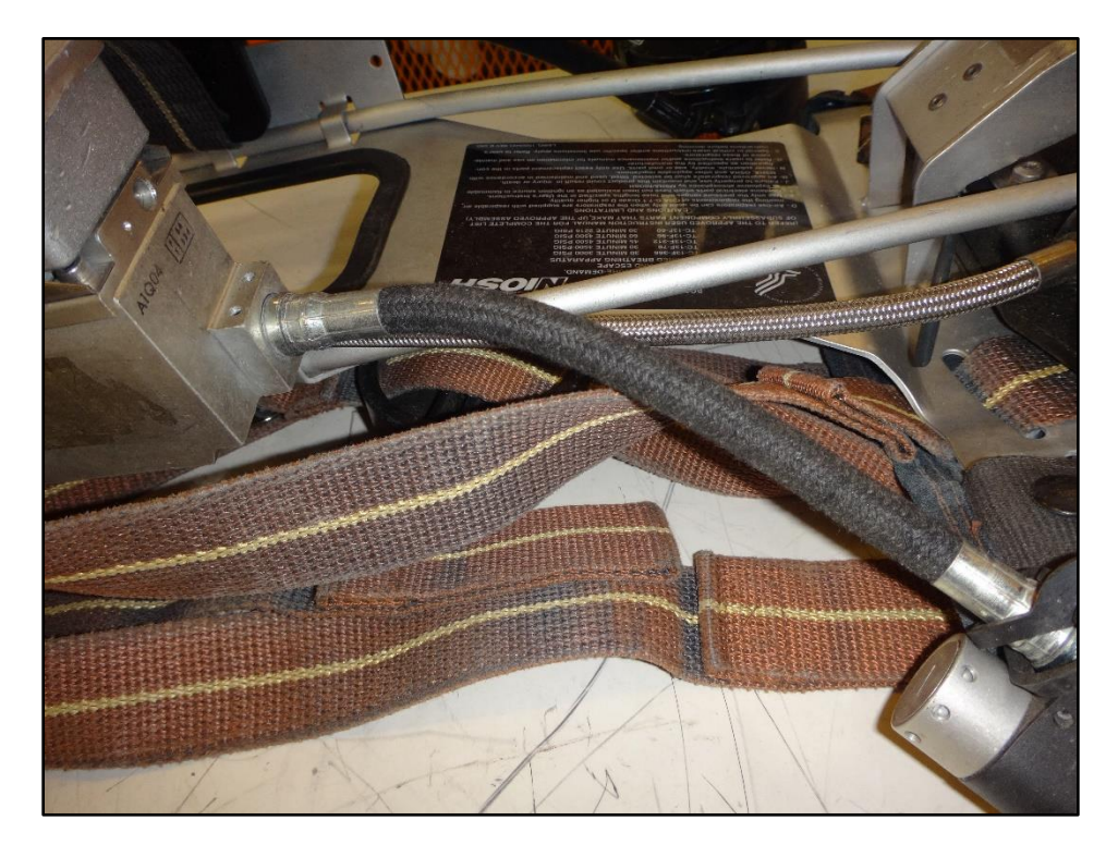
Figure 13: High-pressure hose from cylinder attachment to reducer