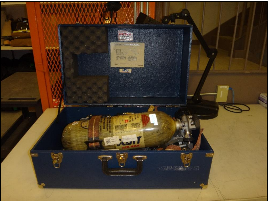
Figure 2: Unboxed SCBA as received