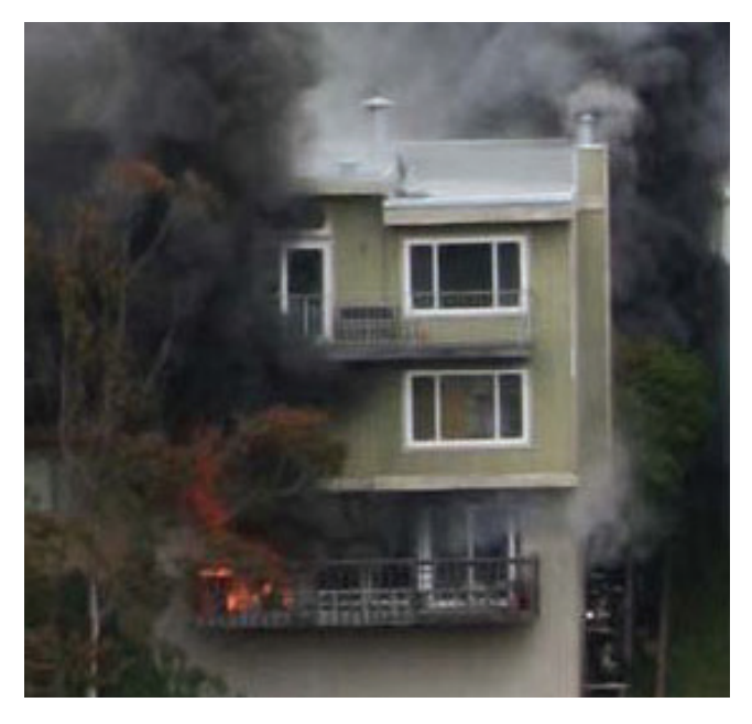
Figure 2. Fire is visible at the rear balcony (Side C). Stairs seen on the right side of the structure were used by fire fighters to enter the structure at Side B.

At about this time, a crew from Engine 24 (E-24) followed the E-26 crew's hose line through the street-level front door. In zero visibility conditions, the E-24 crew found the two downed members of E-26 in the basement. Both members were removed from the structure, and medical attention was initiated before they were transported to a local hospital.