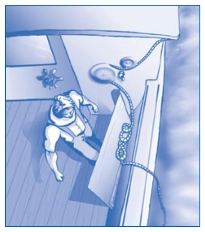
Figure 3. Line bin made of plywood with a piano hinge that allows it to drop open and accept trap rope from the pot hauler. Illustration by Media Stream .

and pass the line in front of the pole to lead the line out of the vessel (Figure 2).