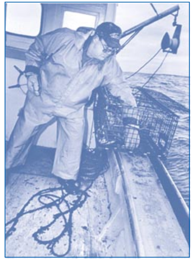
Figure 1. Lobsterman hauling a single lobster trap.

of Public Health and the National Institute for Occupational Safety and Health (NIOSH) recently surveyed lobstermen to