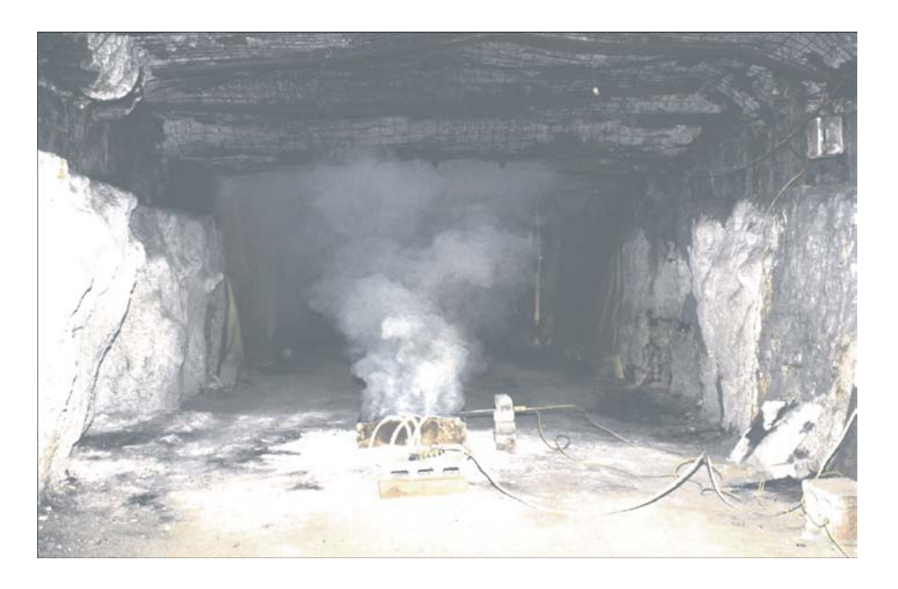
Figure 2.—Smoldering coal fire test in the Safety Research Coal Mine.