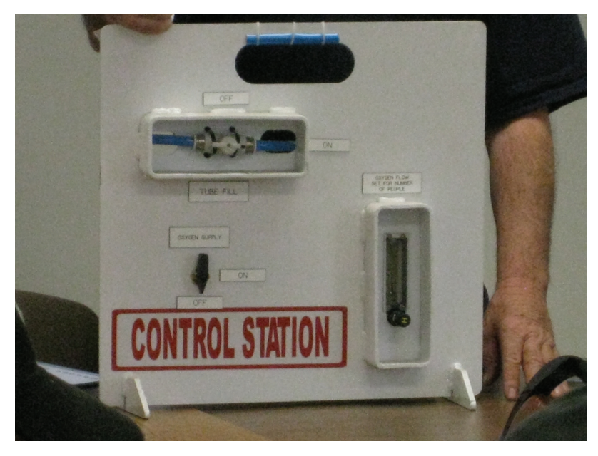
Figure 4. Mock-up of the internal oxygen controls and gauges on a refuge chamber.

A simulation is a more complex and involved form of role play. This could be used at the initial training for operating refuge chambers, or perhaps for annual refresher training when all the miners have already completed the initial training. For a simulation, a mine trainer could choose different groupings of miners in the training session and have them carry out a simulation of an emergency situation. The trainer might choose three miners and provide a scenario such as the following: "Imagine there was an explosion near your section of the mine and you three are the only survivors. You try to escape through all the different available routes out of the mine and discover that they are blocked. Now you have decided to go into a refuge chamber. One of you has a broken leg which you already splinted with some first-aid supplies, but the injured miner cannot move around very well. Work with your team to show what steps you need to take to get all three of you inside the chamber safely." This is an example of a small group activity and could also be a hands-on learning experience if a training unit or mock-ups of the controls are available.