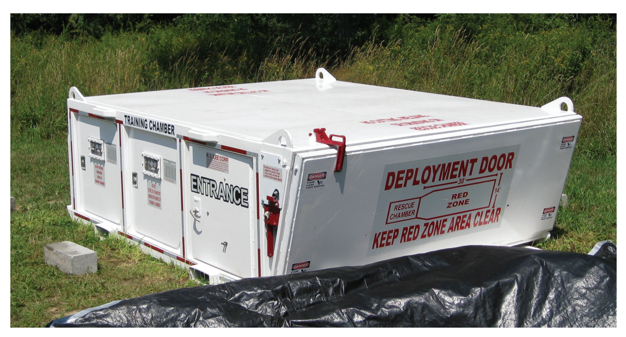
Figure 2. Training model of an inflatable refuge chamber.