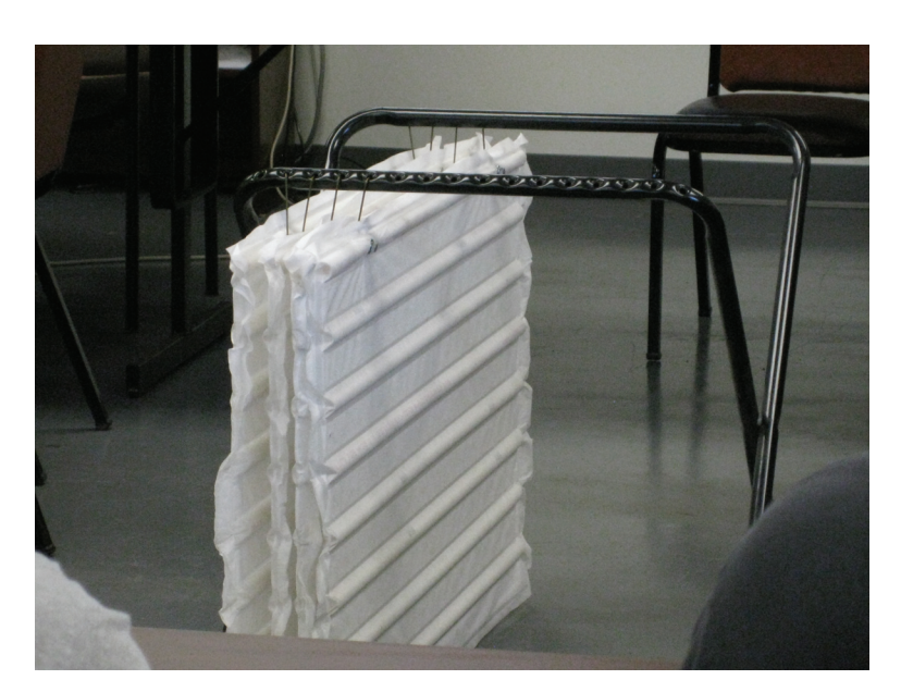
Figure 3. Mock-up of scrubber curtains and the stand used to hold them.