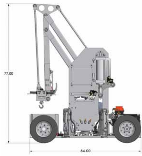
Figure 3.—Design specifications.