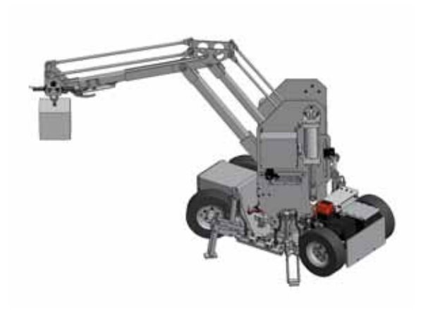
Figure 2.—Manipulator shown loaded with stabilizers activated.

Mention of any company name or product does not constitute endorsement by the National Institute for Occupational Safety and Health.