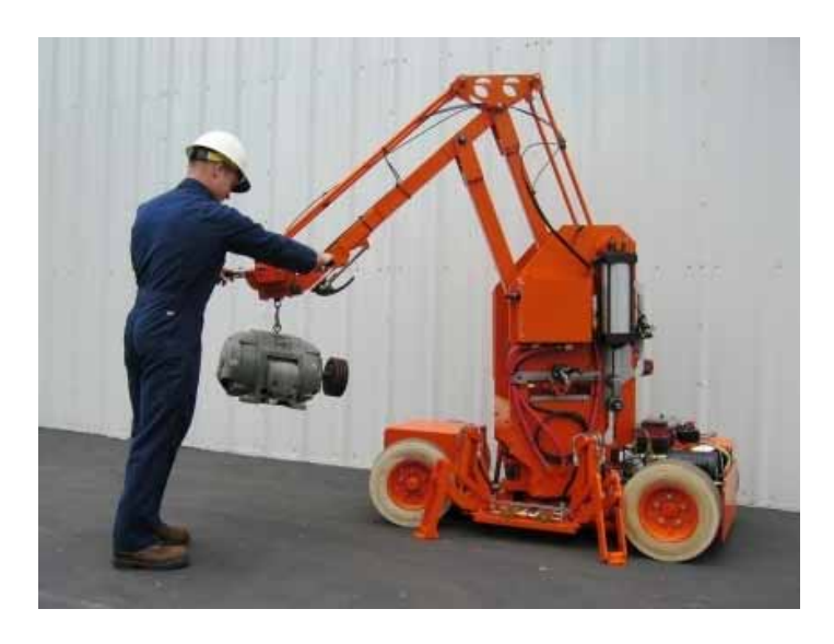
Figure 1.—Manipulator in operation.

The mobile manipulator is a self-propelled, battery-powered lifting arm mounted on a central turret that allows full rotation.