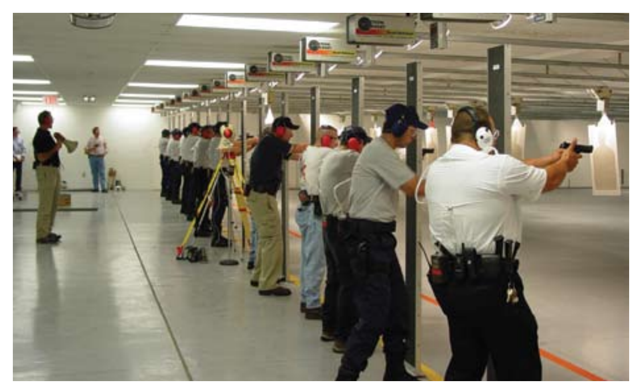
Figure 2. Noise and lead exposure assessment of law enforcement officers at a 20-lane indoor firing range.

technicians, gunsmiths, and firing range instructors. The evaluations also included the potential for take-home lead contamination of workers' vehicles and homes, and for exposure of their families.