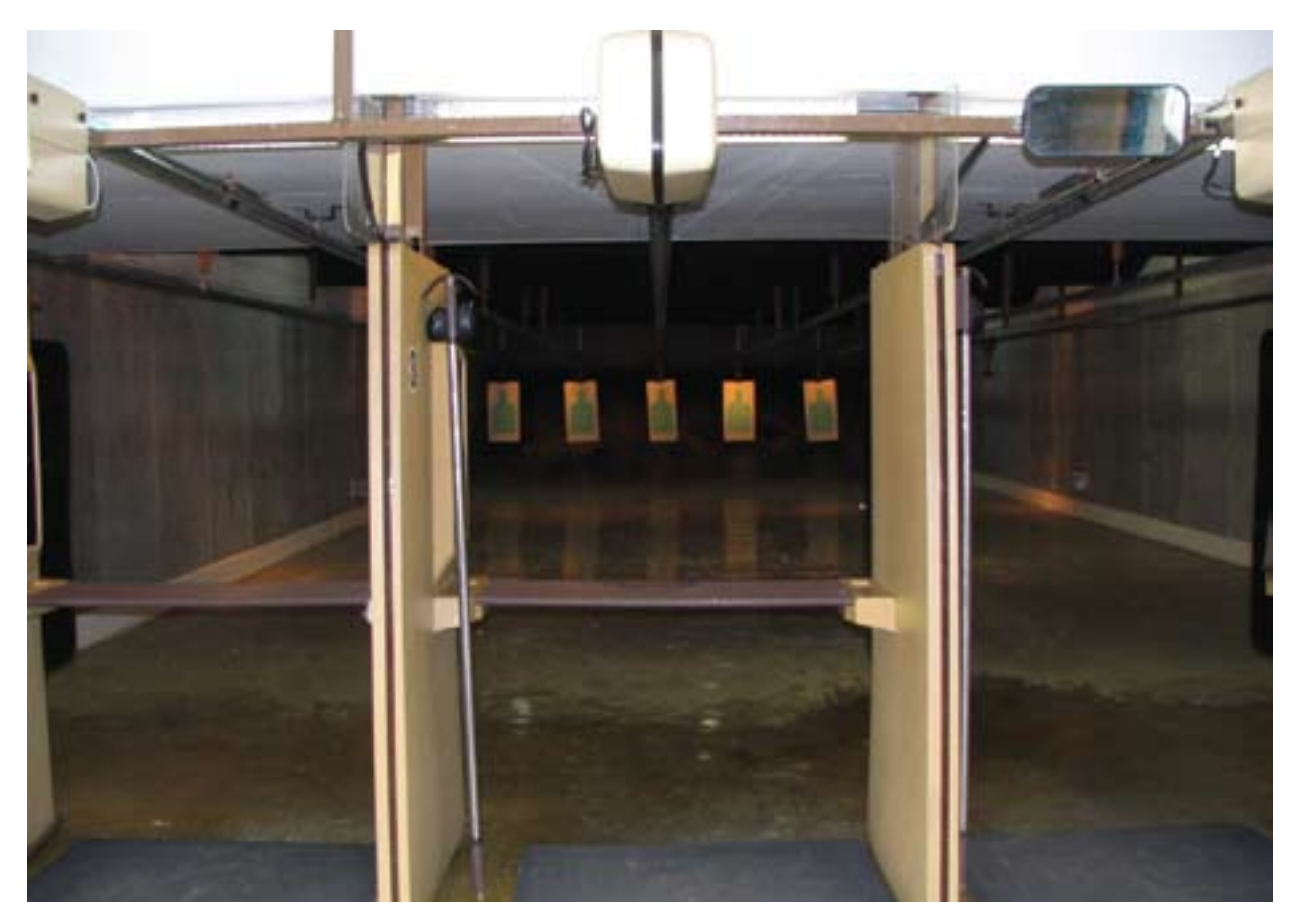
Figure 1. A law enforcement agency five-booth indoor firing range.

The Alaska Environmental Public Health Program initiated a statewide review of schoolsponsored rifle teams after a team coach was found to have an elevated BLL of 44 \mu g/dL [State of Alaska 2003]. The review initially examined six rifle teams using three indoor firing ranges. Thirty-six students and 35 adults (including family members and 6 coaches) participated in the blood lead