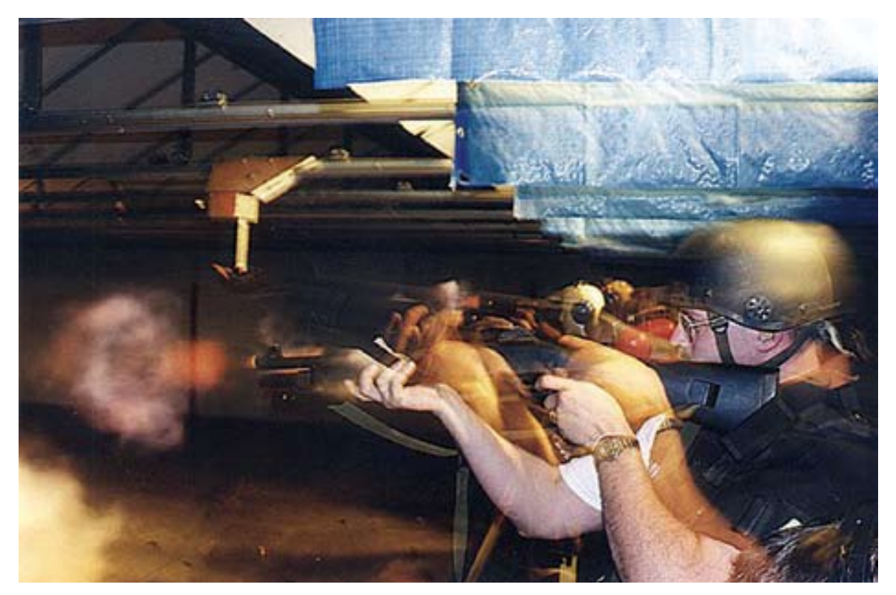
Figure 3. Emissions from the discharge of firearms.

shotgun, and Bushmaster M4 .223-caliber assault rifle). Indoor and outdoor measurements were also obtained for the Smith and Wesson .357-caliber revolver, the Colt .45-caliber and 9-mm pistols, the Glock .40-caliber pistol, the Heckler & Koch H&K 53 and H&K 36 assault rifles, and Colt AR15 .223-caliber rifles. Measurements were conducted using a <sup>1</sup>/<sub>4</sub>-inch Bruel & Kjaer model 4136 microphone, digital audio tape recorders with a 48 kHz sampling rate or were acquired directly to a computer laptop using 96 kHz data acquisition board. Analyses on the digitized waveforms were conducted using software tools built in Matlab. Peak sound pressure levels ranged from 155-168 dB SPL. Figure 4 shows the peak sound pressure levels generated from various weapons at an indoor firing ranges. A-weighted, equivalent (averaged) levels ranged from 124-128 dBA. Hearing protectors were