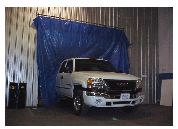
Truck in bed liner spray enclosure.

For additional information, see NIOSH Alert: Preventing Asthma and Death from MDI Exposure During Spray-on Truck Bed Liner and Related Applications [DHHS (NIOSH) Publication No. 2006–149]. Single copies of the Alert are available free from the following: