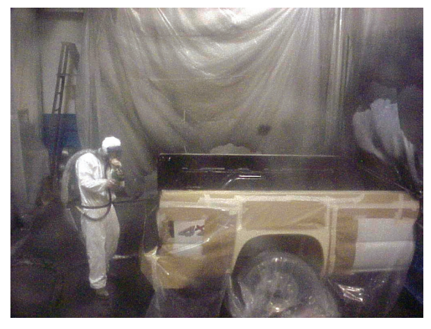
Figure 1. Spraying base coat with protective equipment.

NIOSH identified two spray-on processes commonly found in the industry [Heitbrink and Almaguer 2003]: one process applies truck bed liners at room temperature and