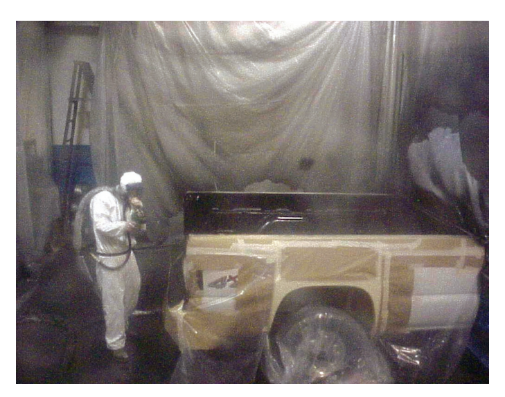
Spraying base coat with protective equipment.

For additional information, see NIOSH Alert: Preventing Asthma and Death from MDI Exposure During Spray-on Truck Bed Liner and Related Applications [DHHS (NIOSH) Publication No. 2006–149]. Single copies of the Alert are available free from the following: