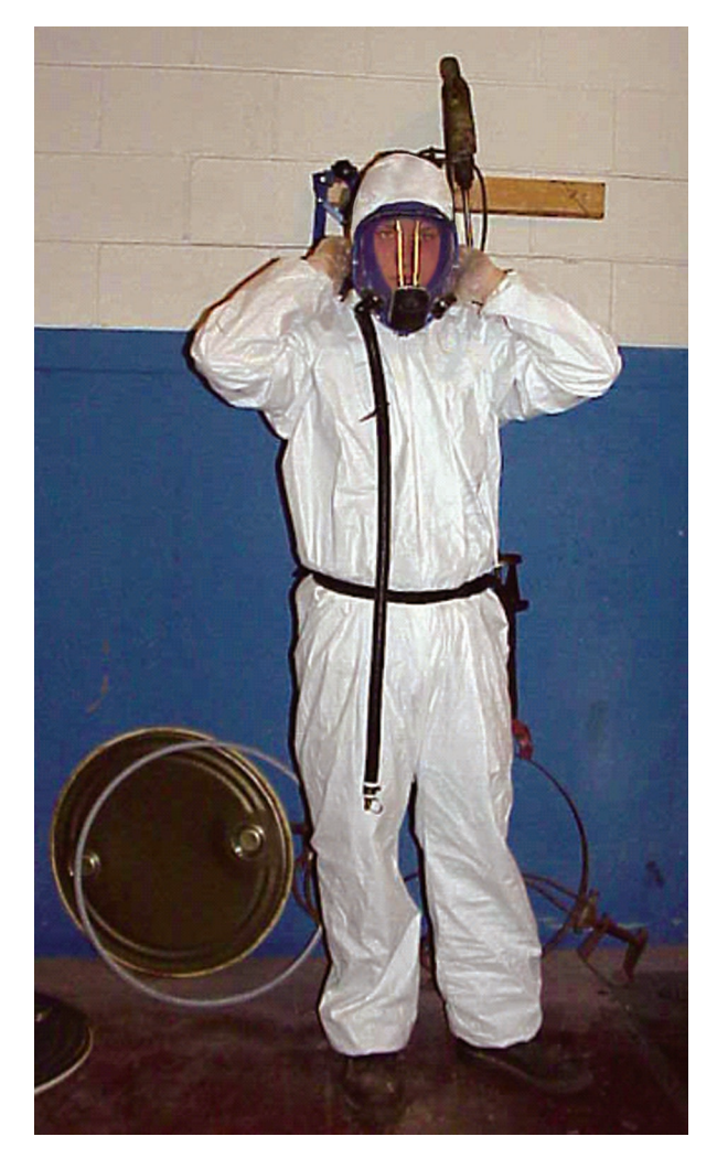
Figure 3. Worker wearing protective clothing and equipment.

When spraying MDI-based products or during entry immediately after spraying, wear