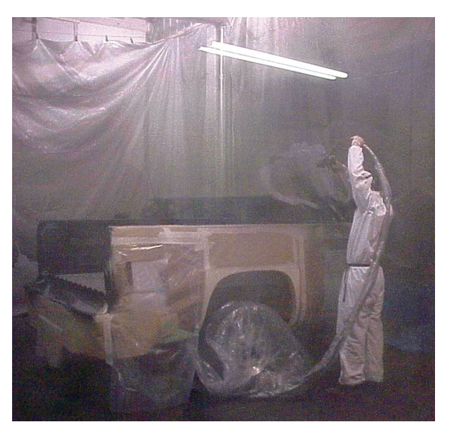
Figure 2. Spraying texturizing coat with protective equipment.

generally mixed in small quantities (quarts or gallons) at room temperature with a high-speed drill. Afterwards, the mixture is poured into a hopper gun and applied at 30–60 pounds per square inch from inside the truck bed. The chemicals used in the cold-batch operations typically contain less MDI (less than 20%). However, the cold-batch materials contain higher amounts of flammable solvents (toluene and N-butyl acetate) which should have their own exposure prevention and ventilation requirements. Cold-batch systems are popular because of the lower startup costs [Krupinski 2005].