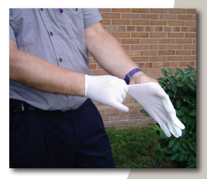
Wear gloves if you must handle dead animals.