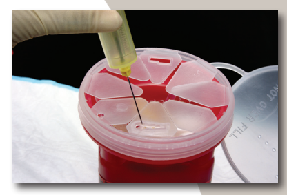
Dispose of sharp devices in sharps disposal containers immediately after use.