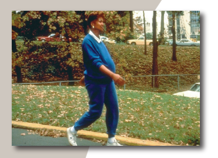
When pregnant workers are outside, they should avoid mosquitoes, wear protective clothing, and use an effective repellent.

of WNV infection. Although some of the babies born to WNV-infected mothers did have health problems, it is unknown whether the WNV infection caused these problems. Because of the limited number of cases studied so far, it is not yet possible to determine what percentage of WNV infections during pregnancy result in infection of the fetus or medical problems in newborns. More research is needed to understand the possible effects of WNV on pregnancy.