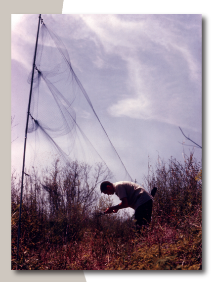
Field workers are at risk of WNV infection from mosquitoes. They also are at risk if they handle infected animals or tissues and their skin is penetrated or cut.

Although WNV is most often transmitted by the bite of infected mosquitoes, the virus can also be transmitted through contact with infected animals, their blood, or other tissues. Thus laboratory, field, and clinical workers who handle tissues or fluids infected with WNV or who perform necropsies are at risk of WNV exposure. Outdoor workers are at risk of WNV exposure whenever mosquitoes are biting.*