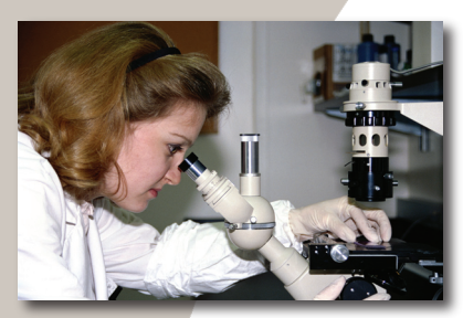
Laboratory workers who handle WNV-infected tissues or fluids are at risk of WNV exposure.