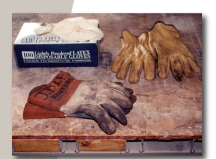
Wear medical examination gloves that provide a protective barrier between blood or other body fluids and your skin. Wear cotton or leather work gloves as the outer pair when heavy work gloves are needed.