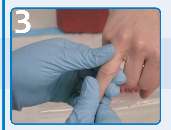
Massage the patient's hand and lower part of the finger to increase blood flow. Turn the hand down.