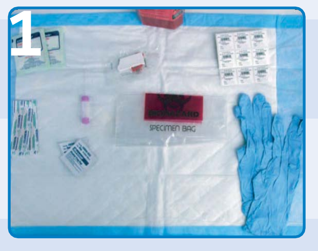
Place all collection materials on top of disposable pad. Open the lancet, alcohol swabs, gauze, bandage, and other items. Have all items ready for blood collection.