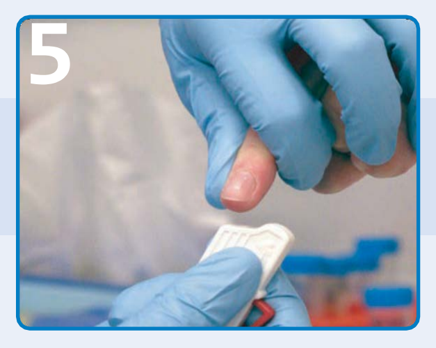
Hold the finger in a downward position and lance the palm side surface of the finger.

Wash the patient's hands thoroughly with soap and water. Allow them to air dry without touching any surface. Do not use paper towels to dry the patient's hands. Put on your powder free gloves.