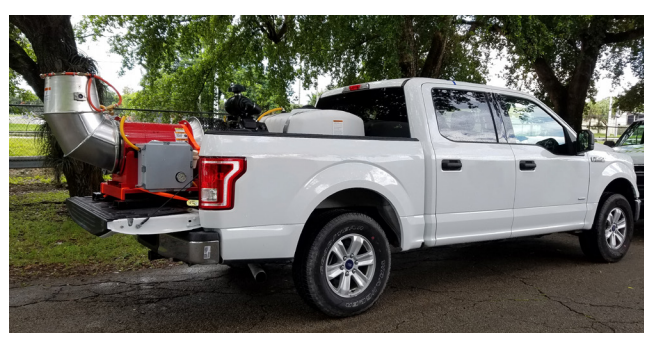
Mosquito control truck used for spraying larvicides like Bti.