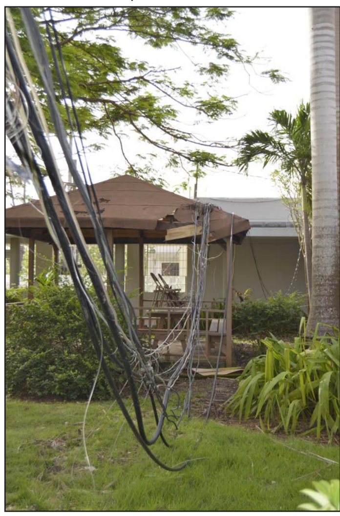
FIGURE 1. Disruption of electrical grid powering the Puerto Rico Department of Health laboratories caused by Hurricane Maria — San Juan, Puerto Rico, September 2017*

Hurricane Maria caused an estimated $90 billion in damage (1) and profoundly affected the island's 3.7 million inhabitants (2). The main PRDOH laboratory facility in San Juan and regional facilities located in Arecibo, Ponce, and Mayagüez municipalities were severely affected by the hurricane. PRDOH laboratories provide critical biologic and chemical laboratory testing activities certified under the Clinical Laboratory Improvement Amendments (CLIA). The destruction of the island's electrical power grid (Figure 1) compounded the situation and rendered the PRDOH laboratory system unable to test for infectious diseases or detect environmental hazards. PRDOH identified repair of the public health laboratories as a major priority during the posthurricane response and