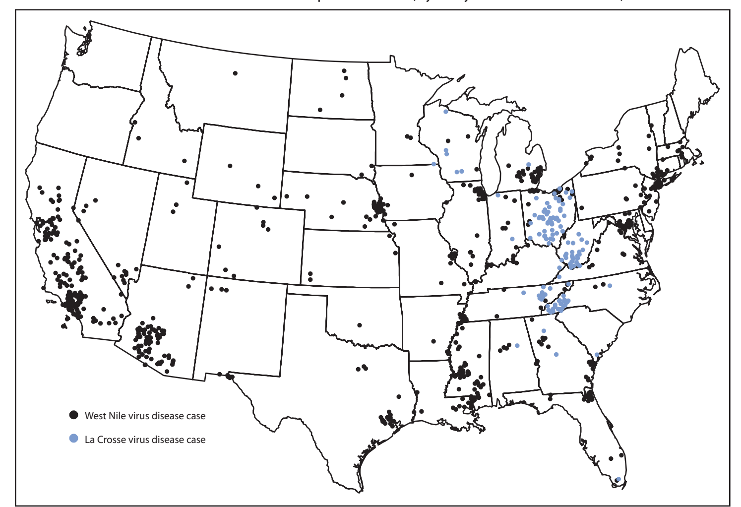
FIGURE. West Nile virus and La Crosse virus disease cases reported to ArboNET, by county of residence — United States, 2011

Therefore, prevention of arboviral disease depends on community and household efforts to reduce vector densities (e.g., applying insecticides and reducing numbers of mosquito breeding sites), personal protective measures to decrease exposure to mosquitoes and ticks (e.g., use of repellents and long-sleeved shirts and long pants), and screening blood donors.