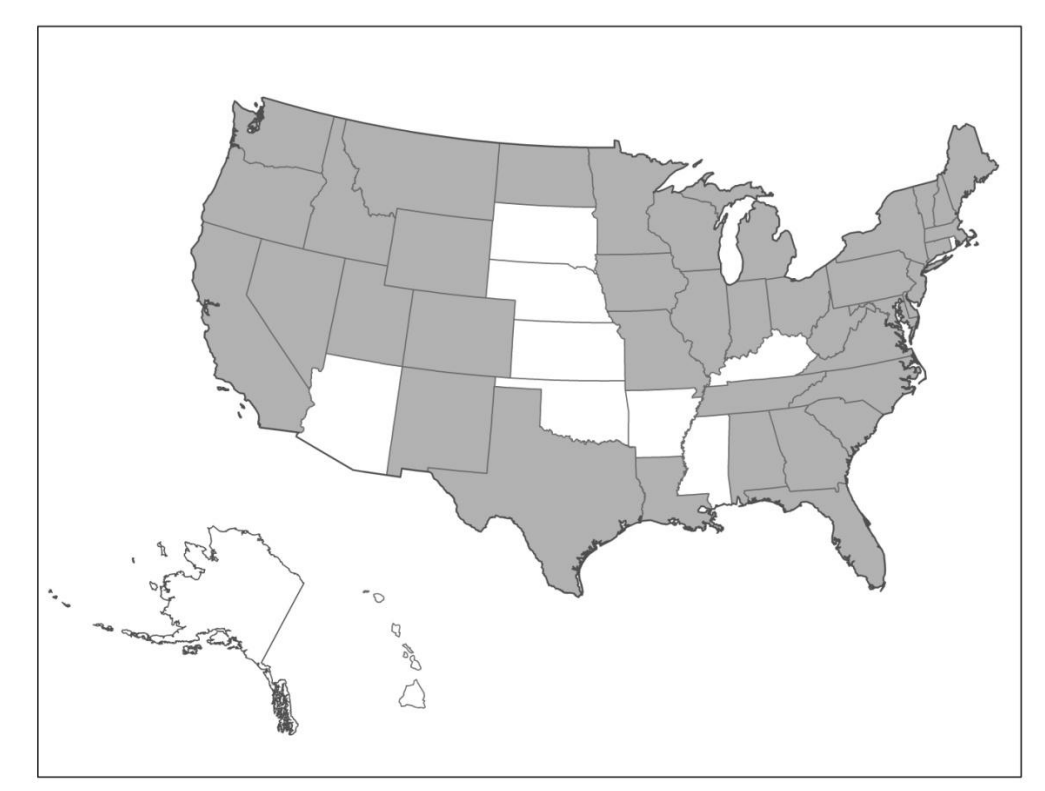
Figure 1. States reporting at least one case of listeriosis to the Listeria Initiative, 2009 (N=40)*.

*Reporting states are indicated in gray.