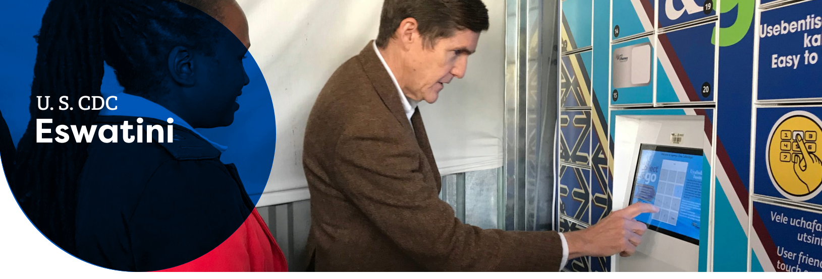
Accessible link: https://www.cdc.gov/global-health/countries/eswatini.html

CDC has been working with the Government of the Kingdom of Eswatini (GoKE) since 2004 and established an office in 2007. CDC collaborates with GOKE and partners to build and strengthen the country's core capabilities. These include data and surveillance; laboratory capacity; workforce and institutions; prevention and response to health threats; innovation and research; policy, communications, and diplomacy. CDC works to address the HIV and tuberculosis (TB) epidemics, strengthen health systems, and enhance global health security.