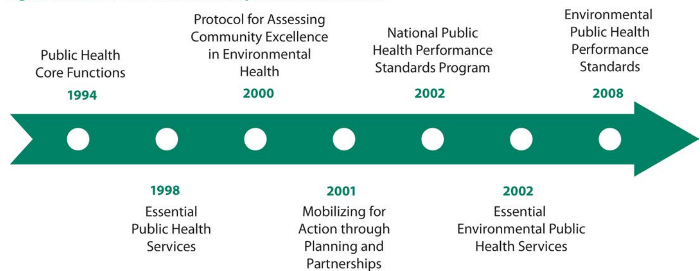
Figure 2. Timeline of Performance Improvement Resources

In 2000, NACCHO and CDC released the Protocol for Assessing Community Excellence in Environmental Health (PACE EH) to address community environmental health needs. PACE EH guides communities and local health officials in assessing community-based environmental health. It uses community collaboration and environmental justice principles to help the public and other stakeholders identify local environmental health issues, set priorities for action, target populations most at risk, and address identified issues. PACE EH helps implement the 10 Essential EPH Services.