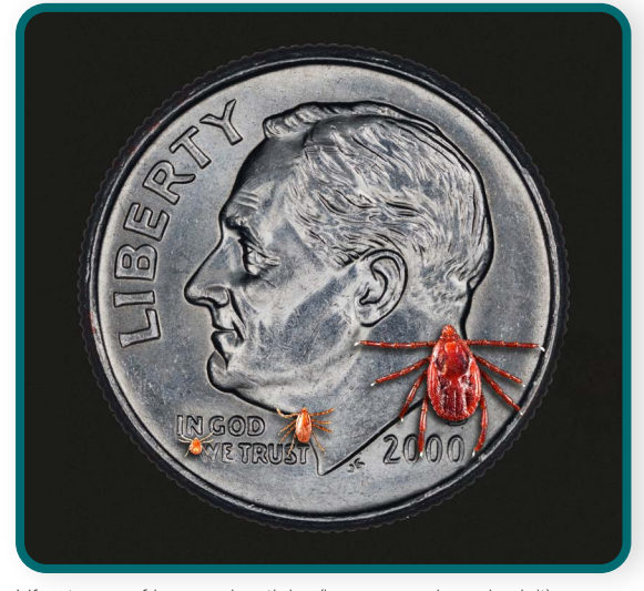
Life stages of brown dog ticks (larva, nymph and adult).