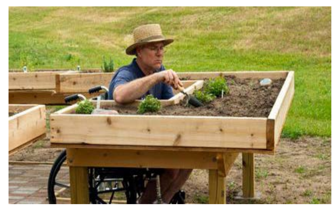
A new raised garden bed in Medford, MA