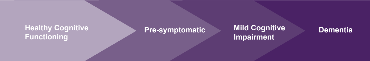
FIGURE 1: LIFE COURSE PERSPECTIVE ON ALZHEIMER’S AND OTHER DEMENTIAS

Dementia occurs along a continuum. Although most older adults have healthy cognitive functioning, some will experience pre-symptomatic changes in the brain that may eventually lead to cognitive impairment or dementia. In dementia, symptoms become noticeable and the disruption to cognition and everyday life can range from mild to severe.